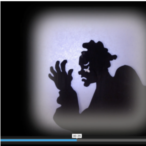
Talking Points: Lauren child