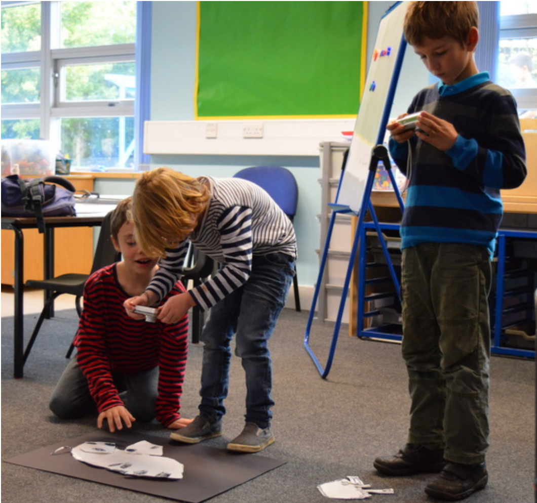
Year 3 & 4 pupils working together to animate their 'beasts' at Milton Road Primary School