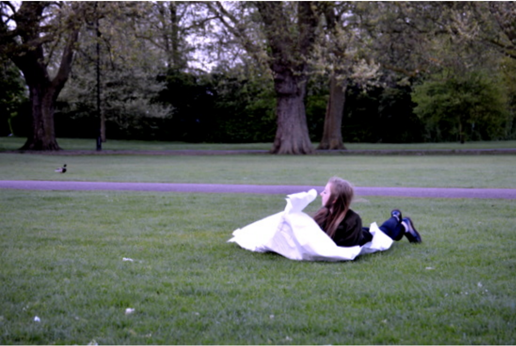
A student from AccessArt's Experimental Drawing Class wrestles with the wind to draw

Somehow yesterday's session crystallised my feeling of responsibility to give students the confidence to trust that being open to new experiences is the catalyst to creative purpose and maintaining the impetus to follow an enthusiasm or whim should be nurtured not measured.