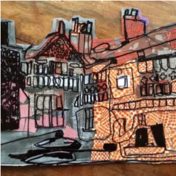
Collagraph, Collage & Stitch