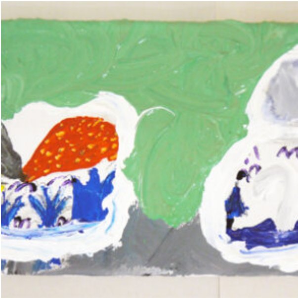
still life inspired by Cézanne