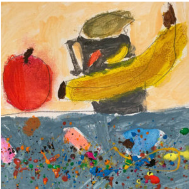
graphic inky still life