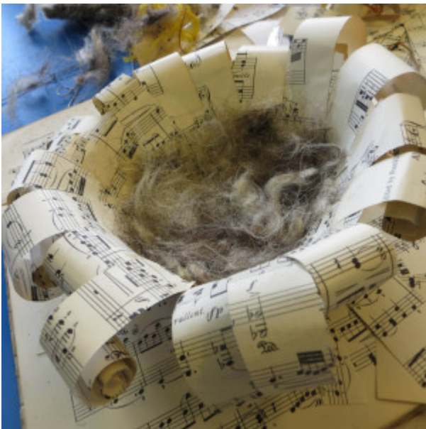
Kinetic Mobile Sculpture