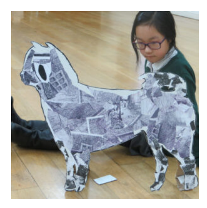
Pathway for Years 5 & 6