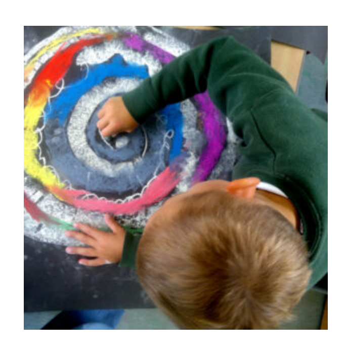
Pathway for Years 1 & 2 storytelling through drawing