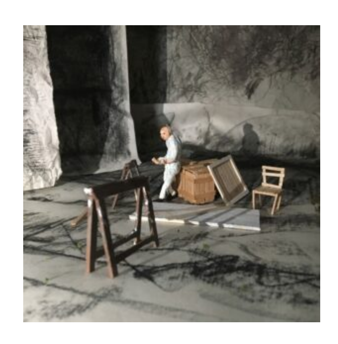
Pathway for Years 3 & 4 2D Drawing to 3D Making