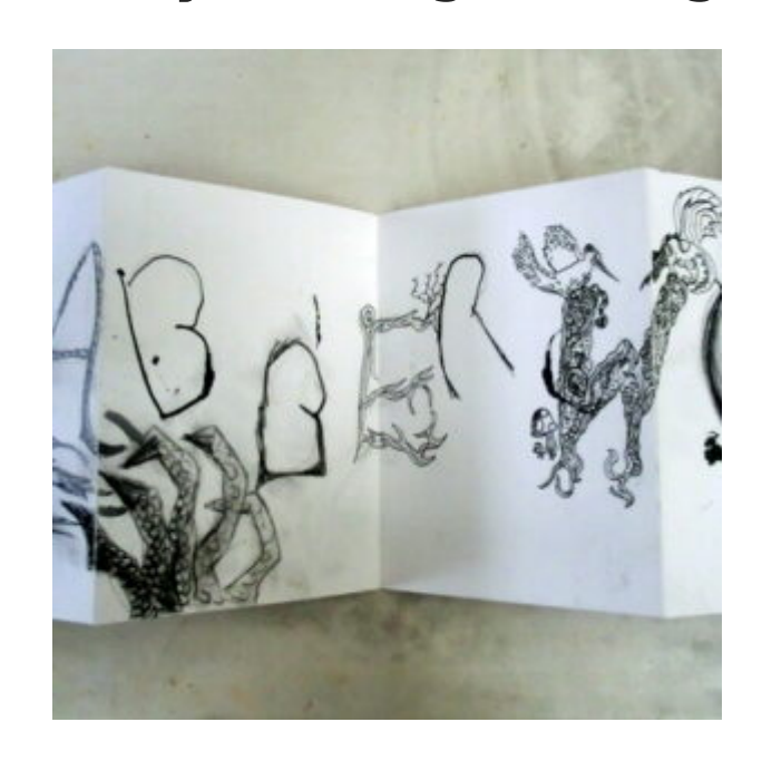
Pathway for Years 3 & 4 Explore and Draw