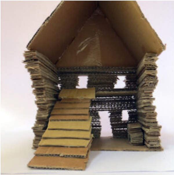
Anglo Saxon Houses