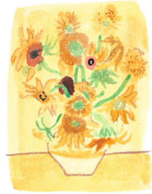
SUNFLOWERS VINCENT VAN GOGH

And just as importantly, drawing enables us to assimilate information relating to other curriculum areas too, such as science, history and geography.