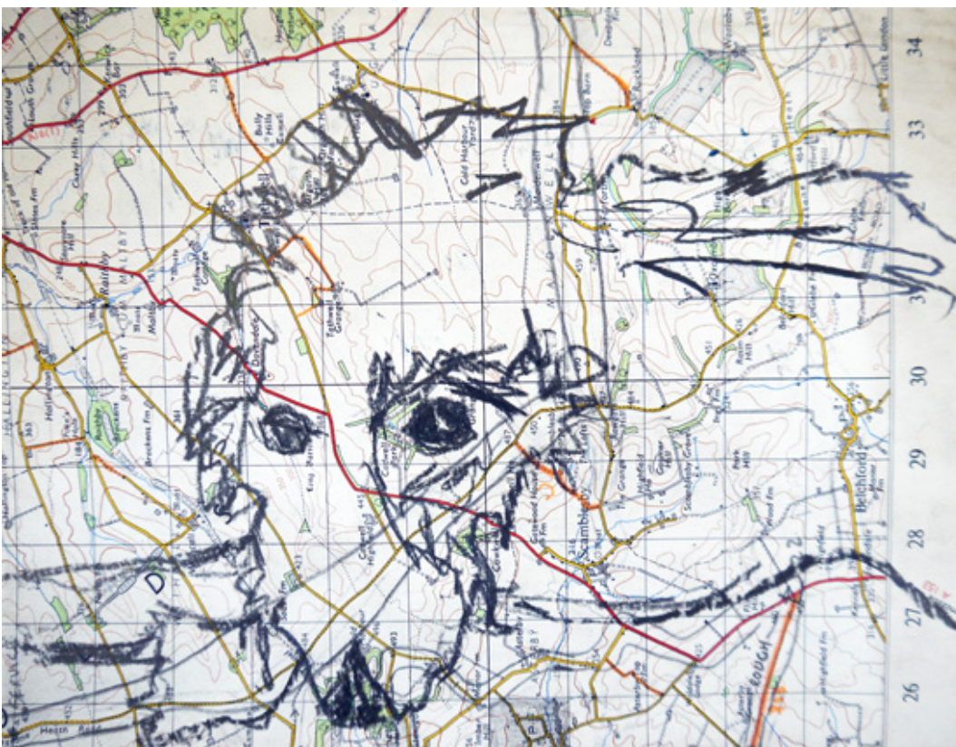
Drawing over maps

I developed the idea of using the personality of the paper to help shape the drawing in a second exercise, which I did the following week: Exercise for Making an Artist's Book / Sketchbook