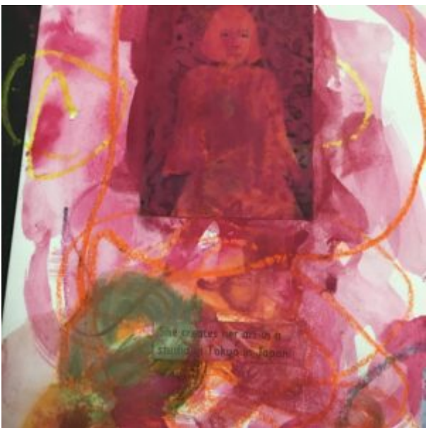
the creates her art in a studio in Tokyo in Japan