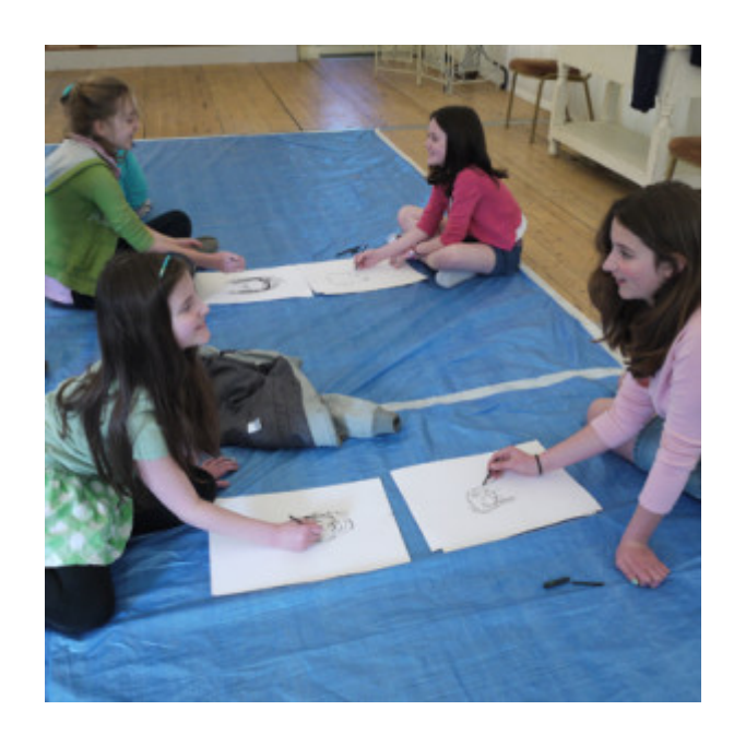
Look up, Not down

<u>Using chalk and compressed charcoal and working quickly and rhythmically to create a pile of portrait studies.</u>