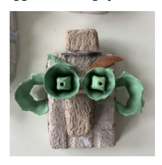
Egg Box Gargoyles

Starting off with a balanced object that can be manipulate and added to — enabling the process of creating dynamic figures that can stand independently.