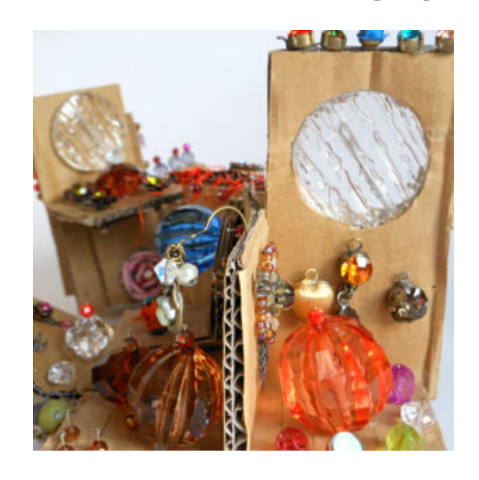
the transformation project