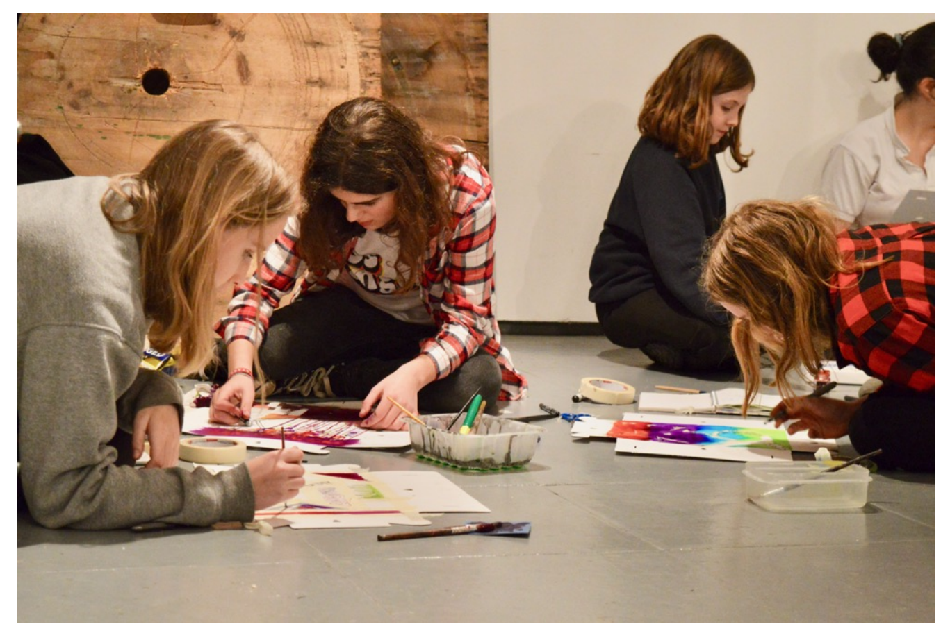
Schools, Colleges, Arts Organisations: Single and Multi-Users From £42

AccessArt is a UK Charity and we believe everyone has the right to be creative. AccessArt provides inspiration to help us all reach our creative potential.