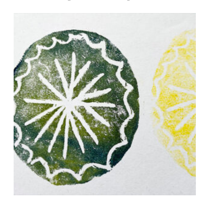
<u>Featured in the 'Simple Printmaking'</u> <u>pathway</u>