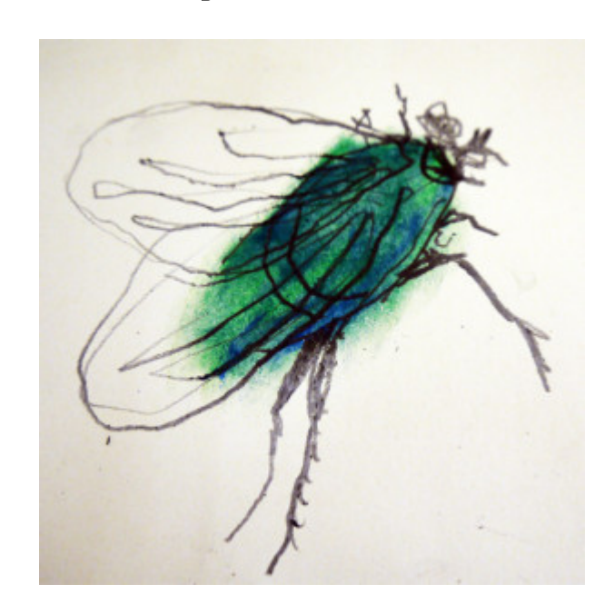
This is featured in the 'Flora and Fauna' pathway

Talking Points: Artists inspired by flora and fauna