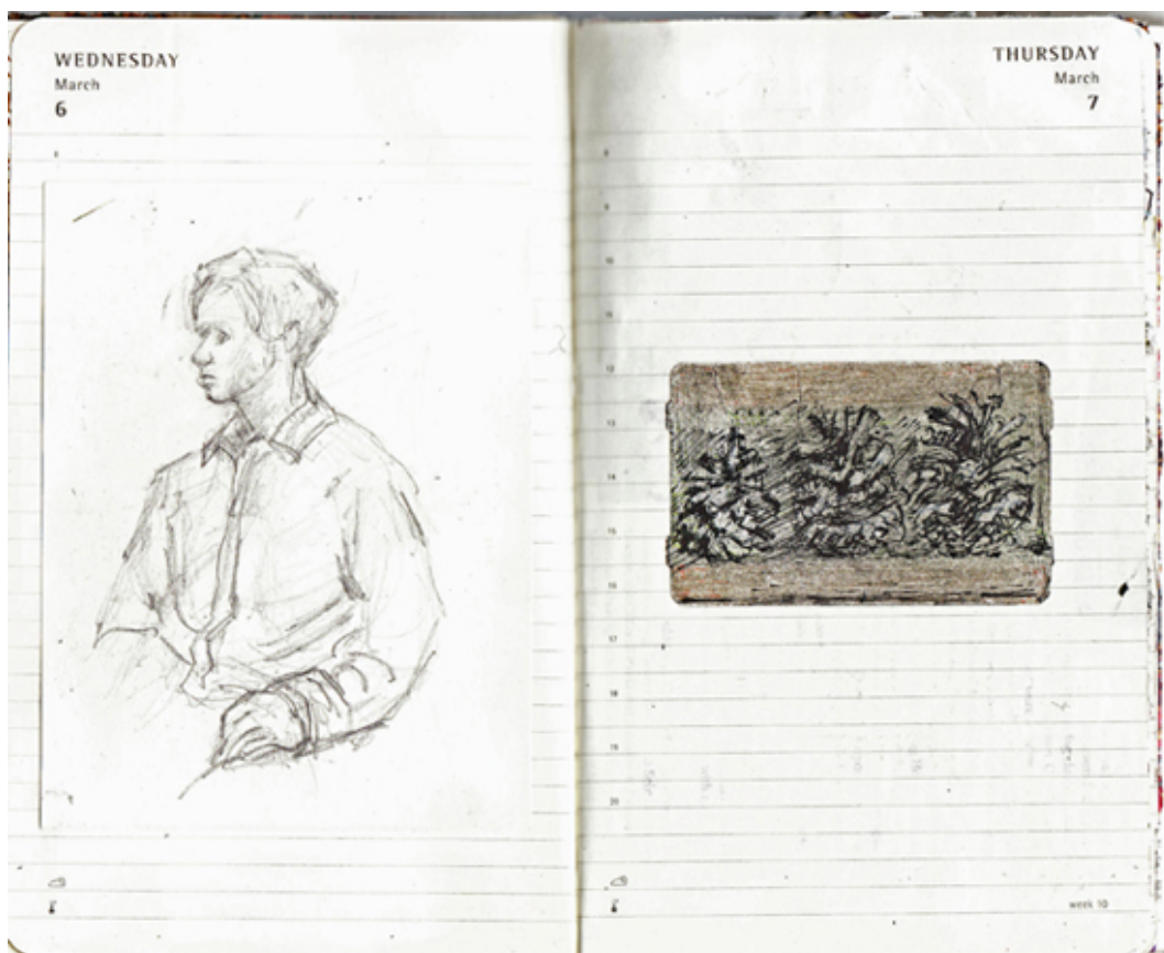
Gesture and Ticket: Quick observational drawing, and drawing on a train ticket from a journey that week. Andrea Butler