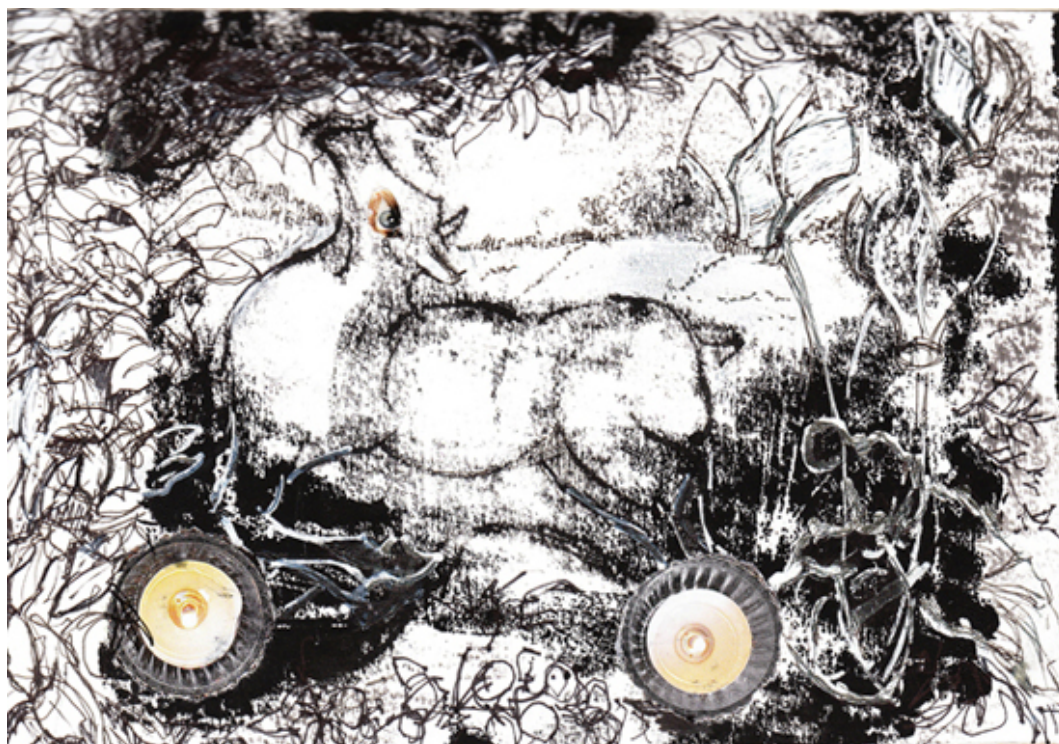
Deer: Monoprint of a drawing with ink smudges and