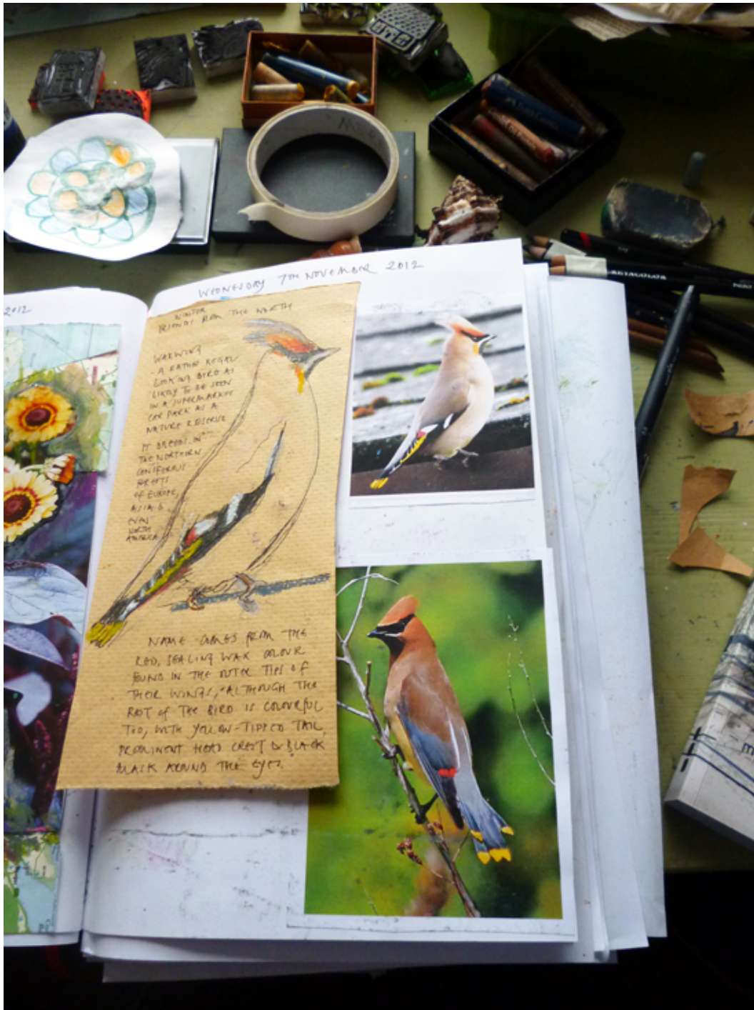
A new quick drawing on a scrap of brown wrapping paper stuck over original drawing, but still allowing access to original for comparison.