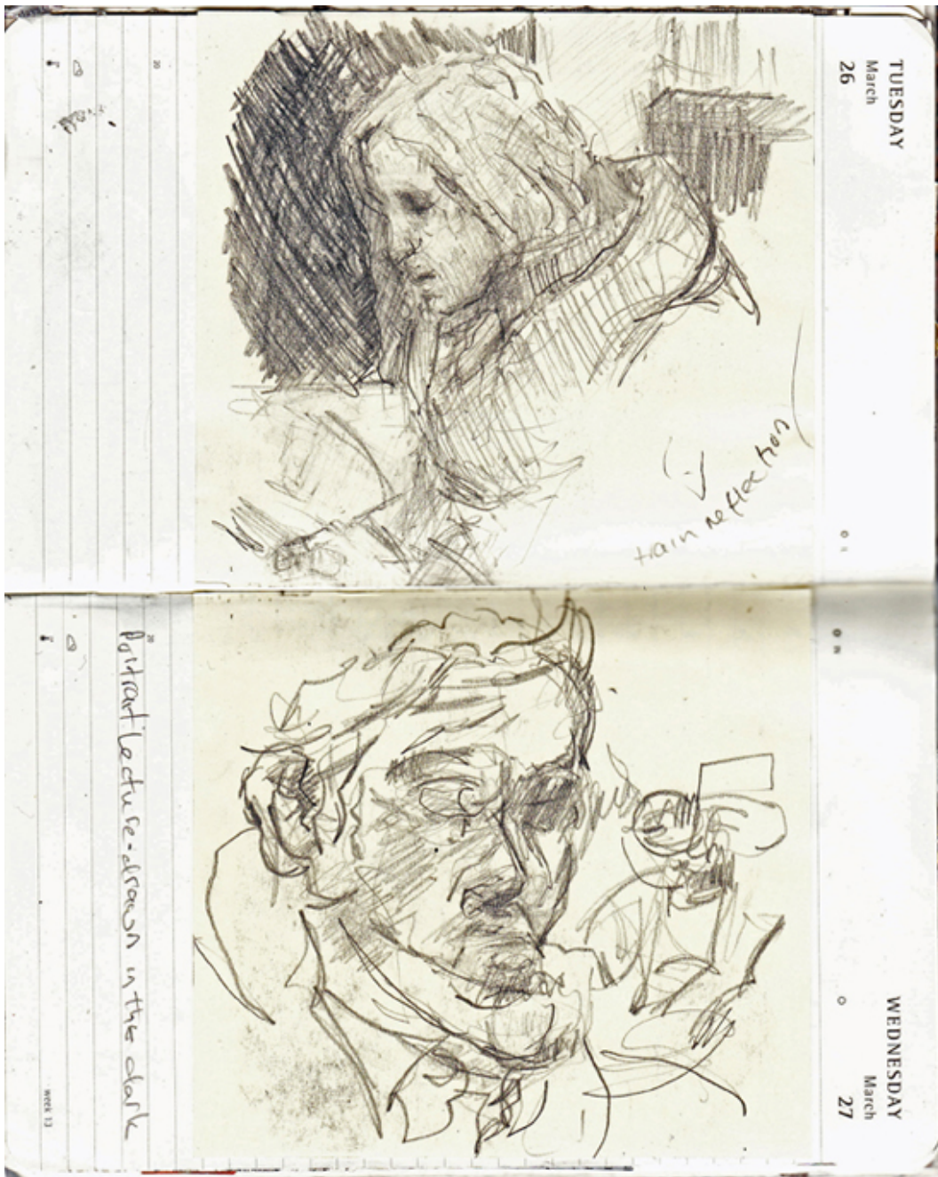
Drawing on Train and in a Lecture: Drawing of a reflection in the train window on the journey home and a drawing done in the dark at an art lecture. Andrea Butler

Here's a collection of ideas as a resource for those more challenging days when a little inspiration/support might help!