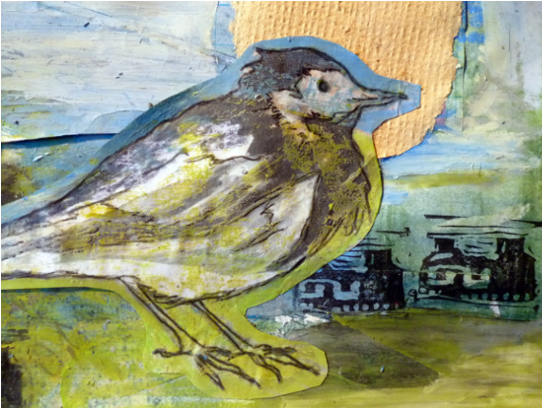
Detail of collage piece inspired by memories of Orkney. Mixed media using old wallpaper, tracing paper, eraser printmaking, colour pencils and oil pastels. The bird (a wagtail commonly found in Orkney) was taken from an earlier drawing which didn't work. Scale also explored here.