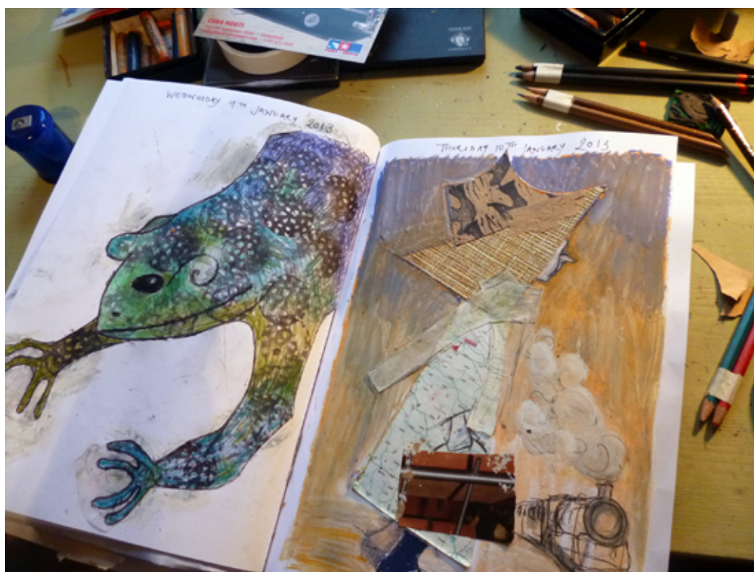
Example of visual diary with written dates at top of page.

"The drawing needs time to 'exist' before it is understood", Sheila Ceccarelli,