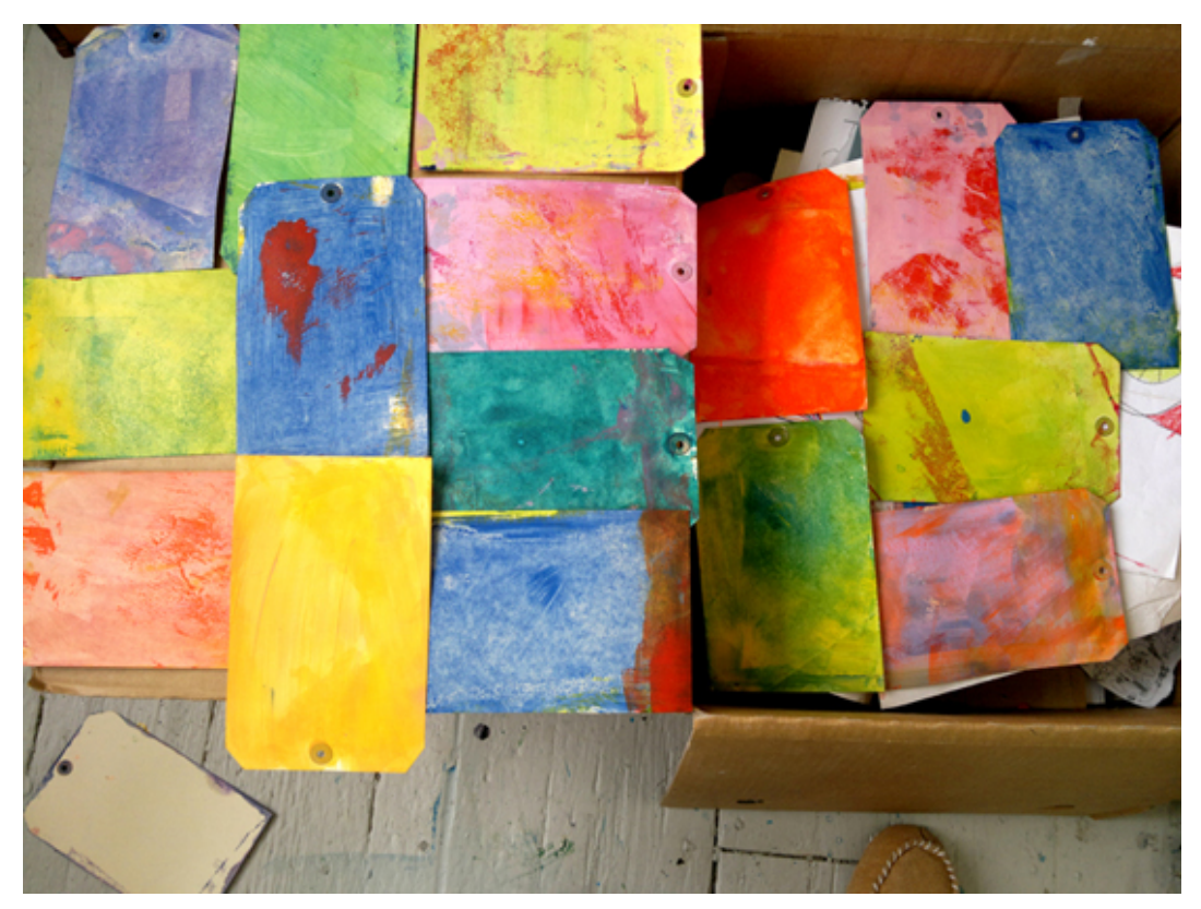
Painted card ready to be cut into shapes

The project tied in with their current topic of minibeasts . There were 83 children aged between 4 and 5 years old. They were broken up into small manageable groups.