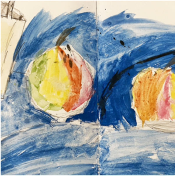
Year 4, Manland Primary