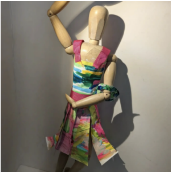
Year 5, Carden Primary School