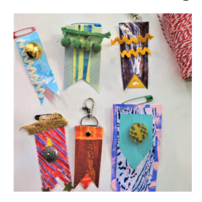
Developing the Curriculum - FAQ