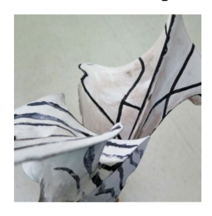
The Drawing Journey