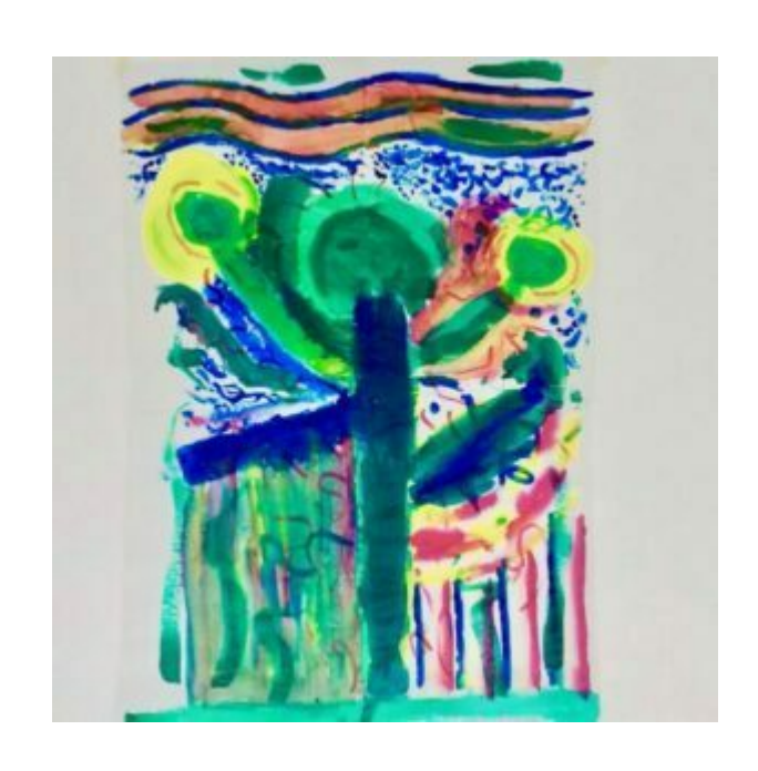
Feel Part of a Wider Community & Build Your Expertise...