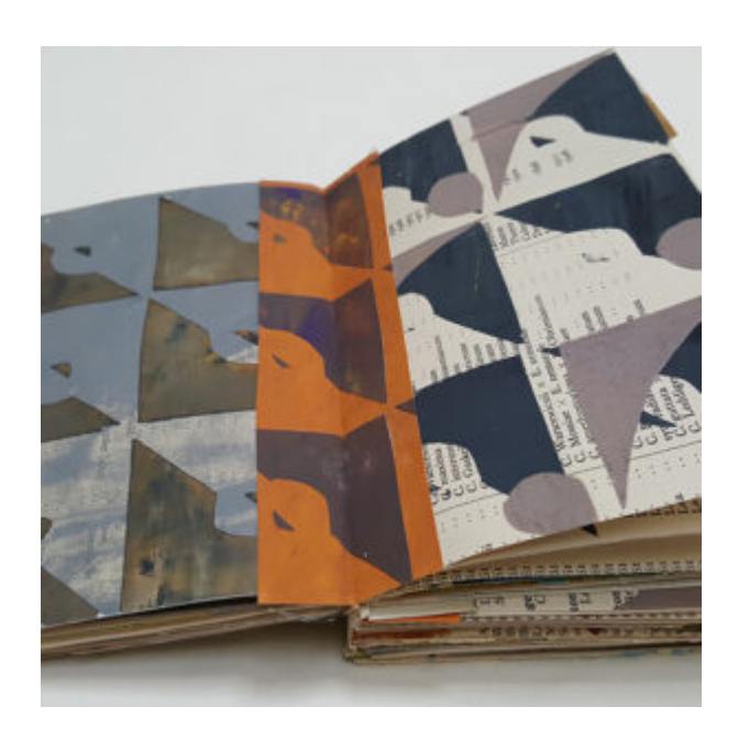
Drawing and Making