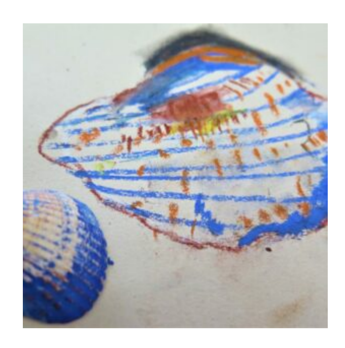
The Sketchbook Journey