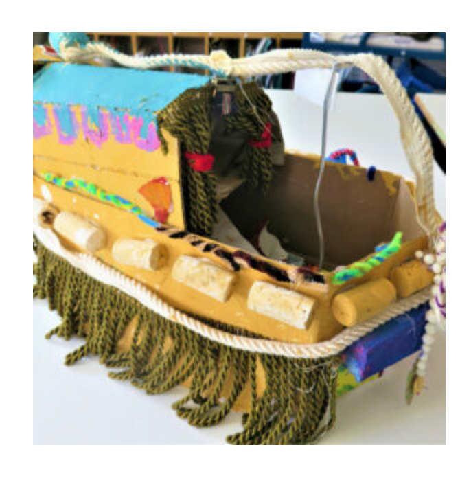
Resources for Ages 5-11