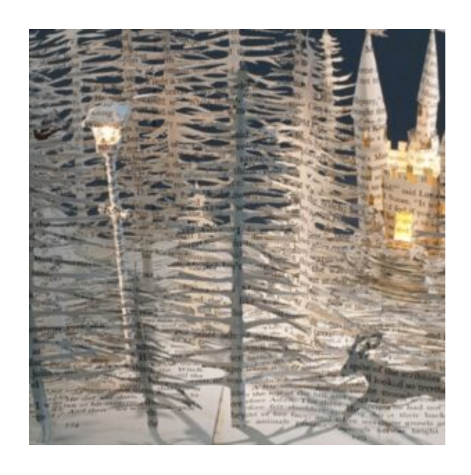
The Sketchbook Journey