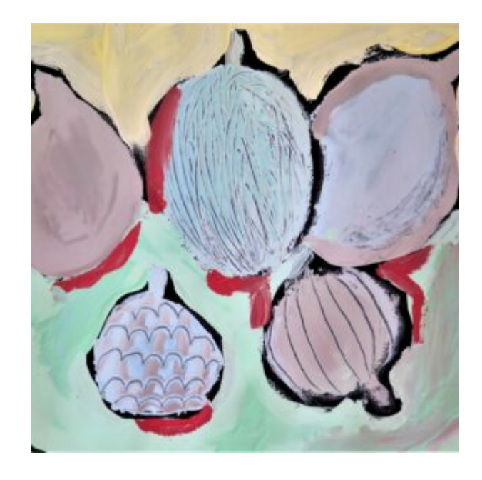
Visual Arts Planning