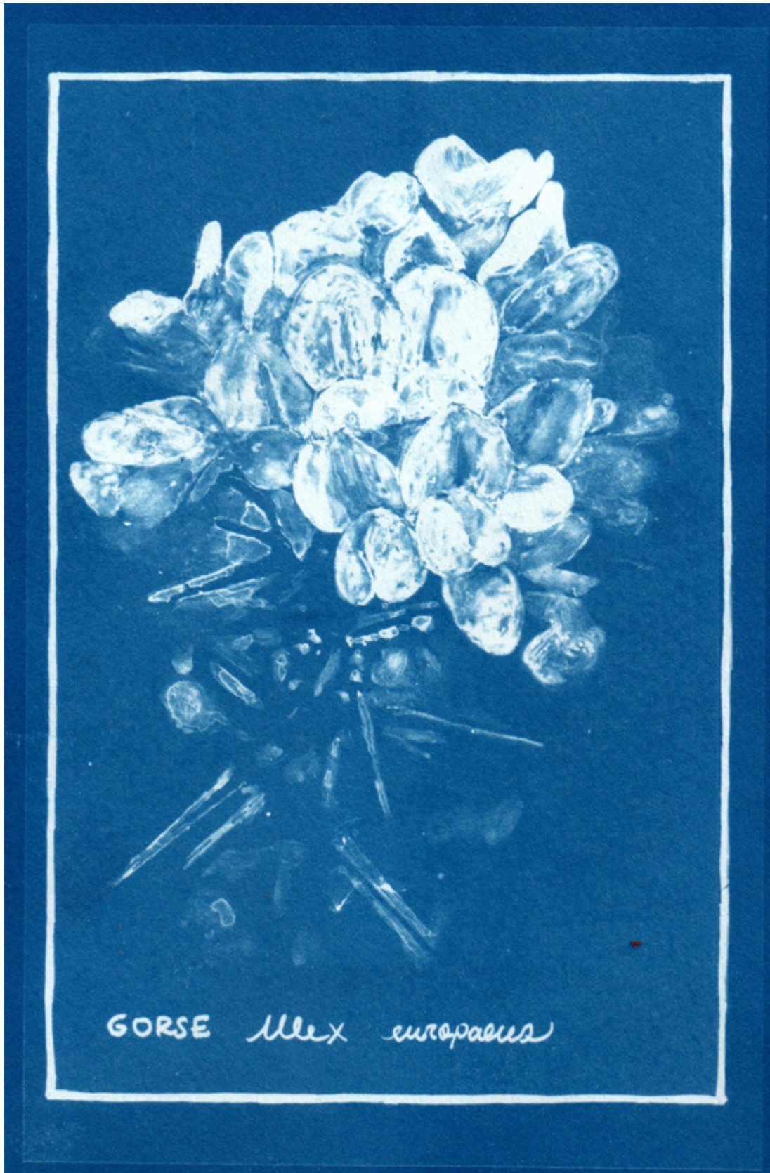
GORSE Vex europaeus

Maru shares the beautiful process of cyanotype. The project can be adapted to any theme and works well with teenagers and adults, resulting in stunning images.