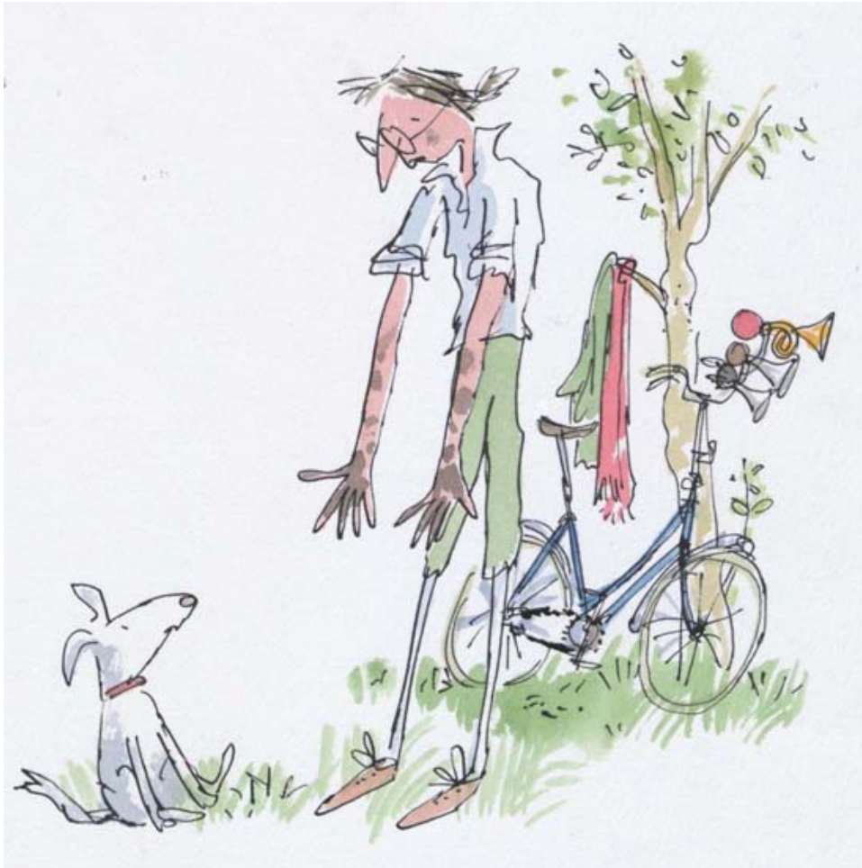
Image (c) Quentin Blake, 1987 from 'Mrs Armitage on Wheels' (published by Jonathan Cape)