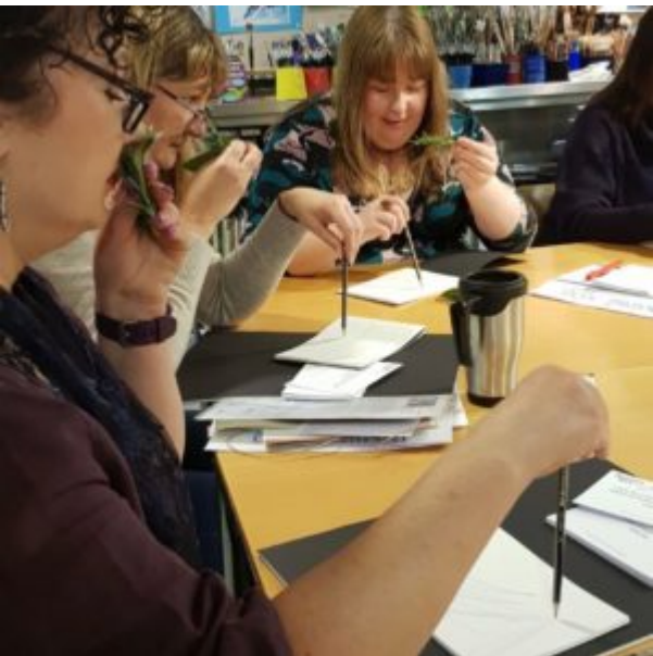
Accessart Facebook Group