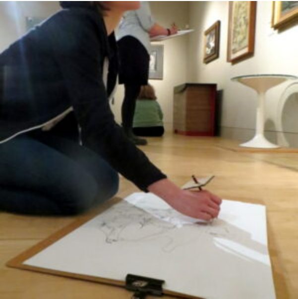
art educator networks