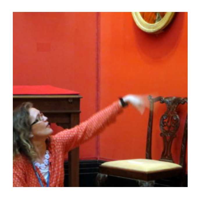
MAKING SCULPTURAL INTERPRETATIONS OF 18TH CENTURY PORTRAITS