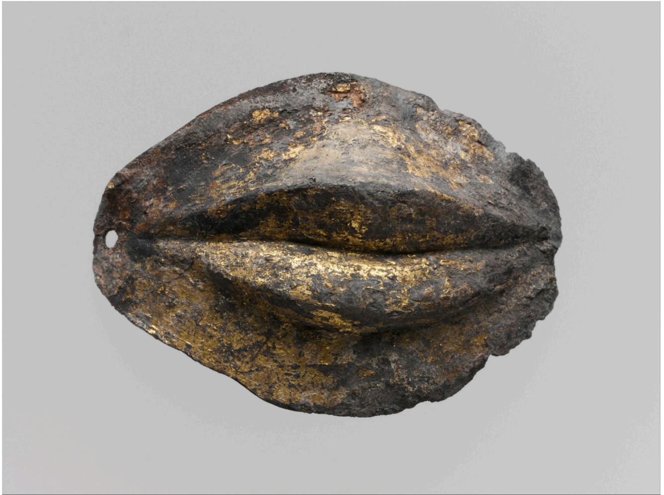
Cypriot Silver-gilt mouthpiece 6th–5th century B.C.