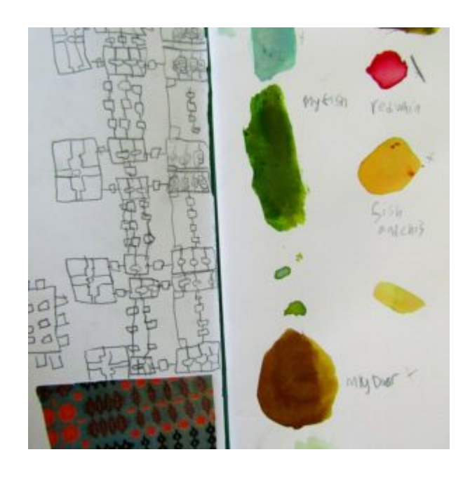
Show me what you see