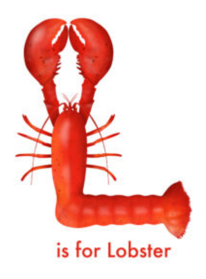
Making a Monogram