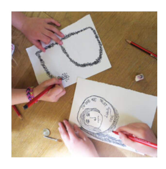
Making an illustrated Alphabet