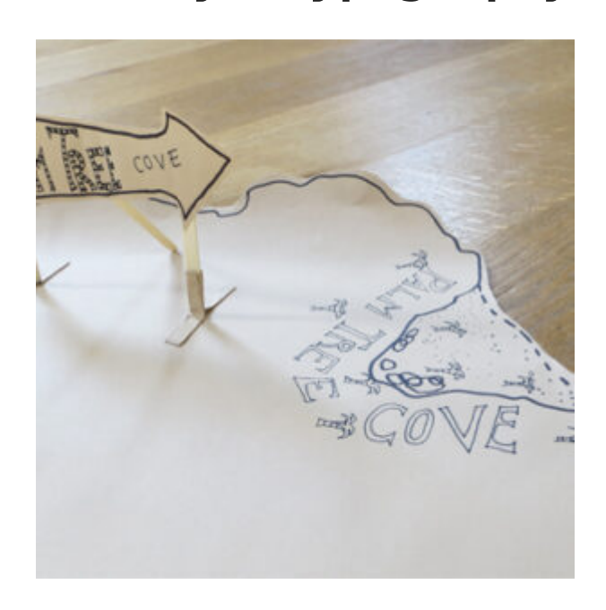
This is featured in the 'Typography and Maps' pathway