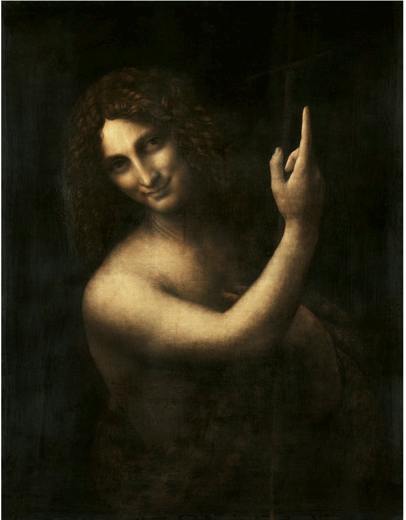
Leonardo da Vinci 's Saint John the Baptist (1513-1516)