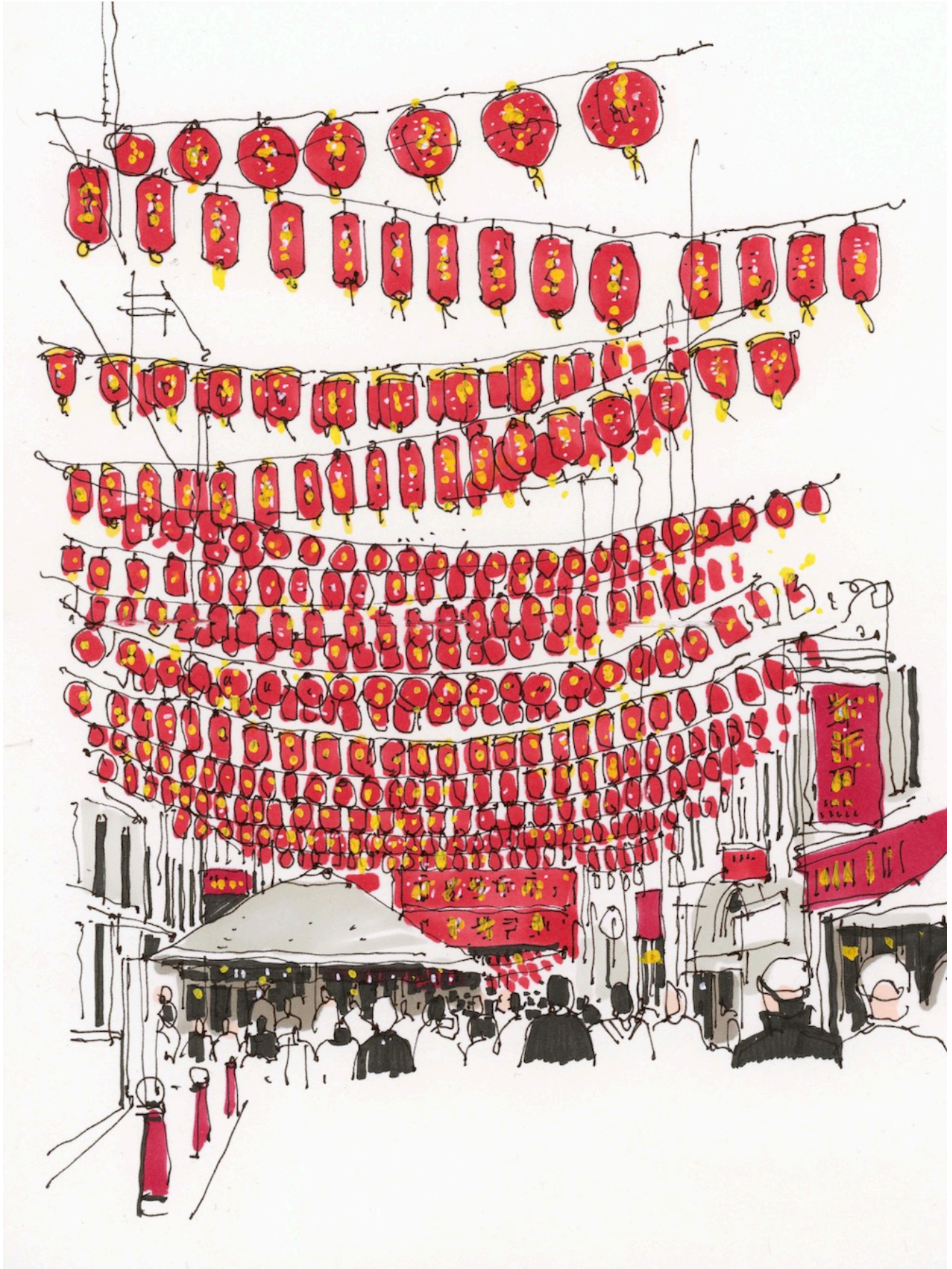
Chinatown London by the Shoreditch Sketcher