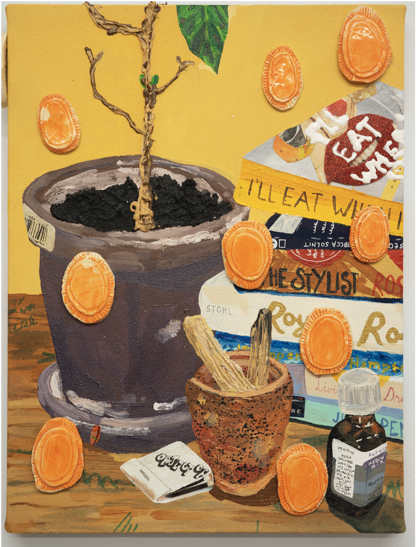
Ladies, Ladies, Ladies, 2018 Acrylic, ink,