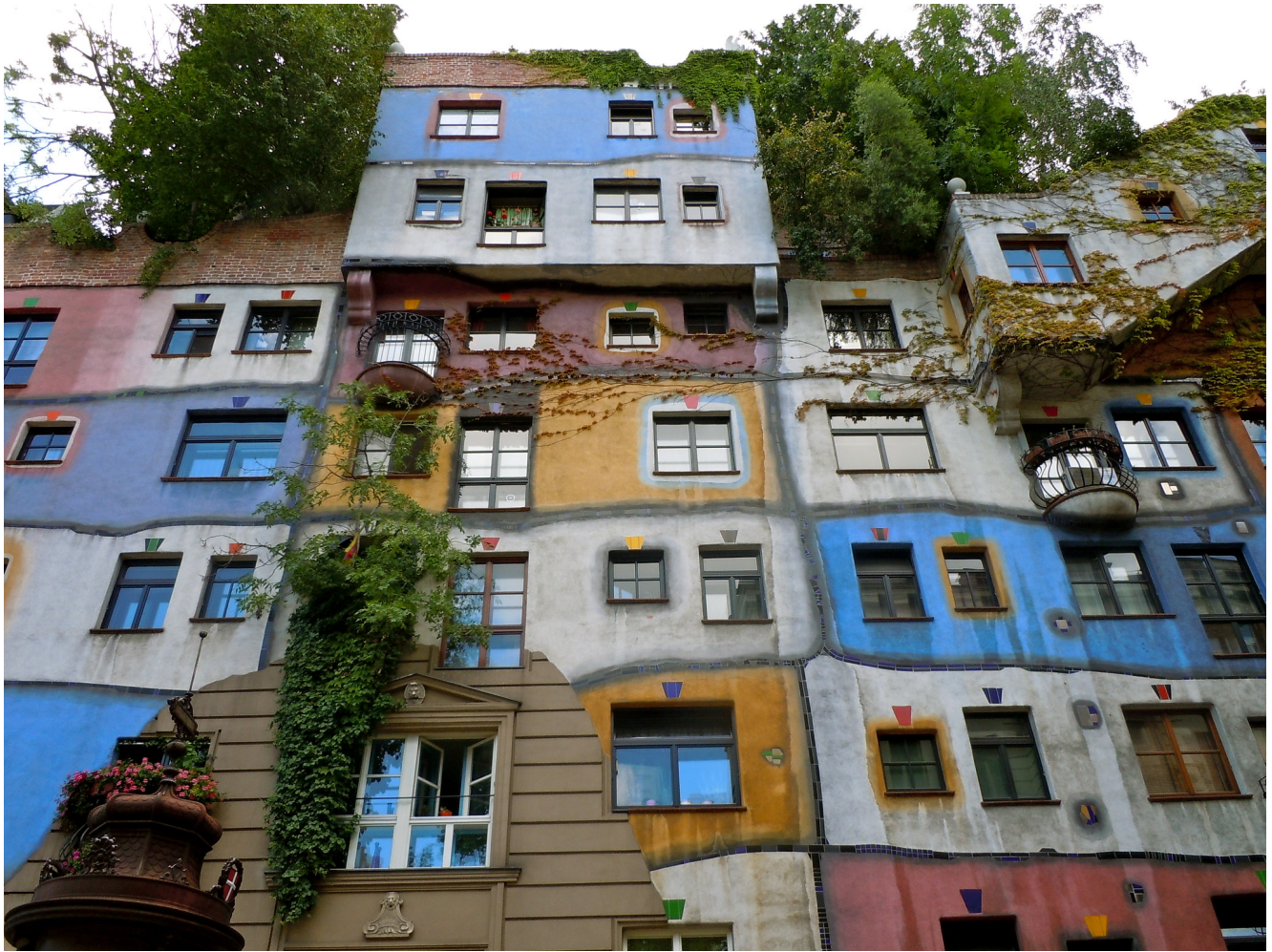
Hundertwasser House