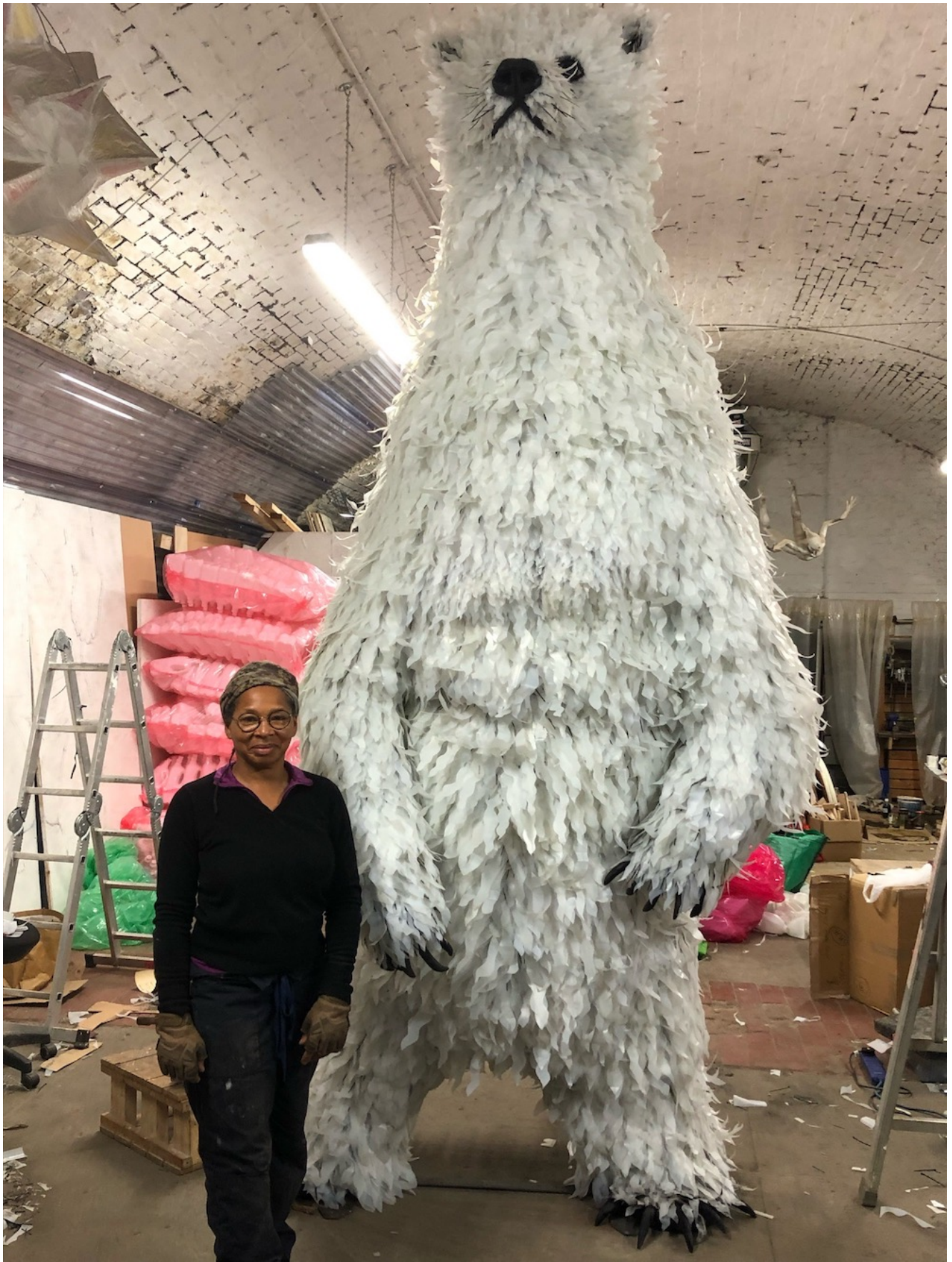
Polar Bear In The Studio (Created With 3000 Plastic Milk Bottles) by Faith Bebbington