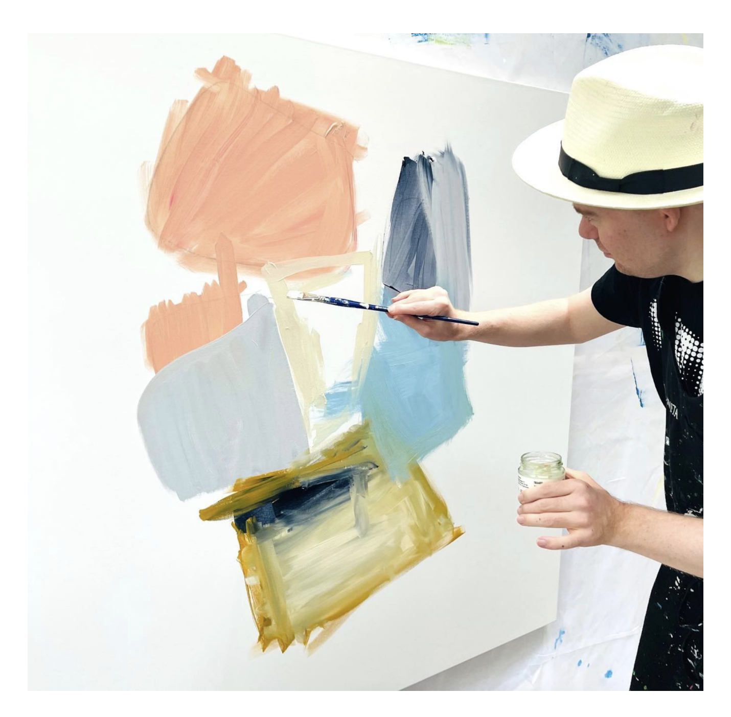
"What inspires you?"

"I am asked that question a lot. And I think there are obvious ones you see in my series: Disney movies, music, the ocean, the beautiful world I see, my happy memories and an imagination that cracks me up.