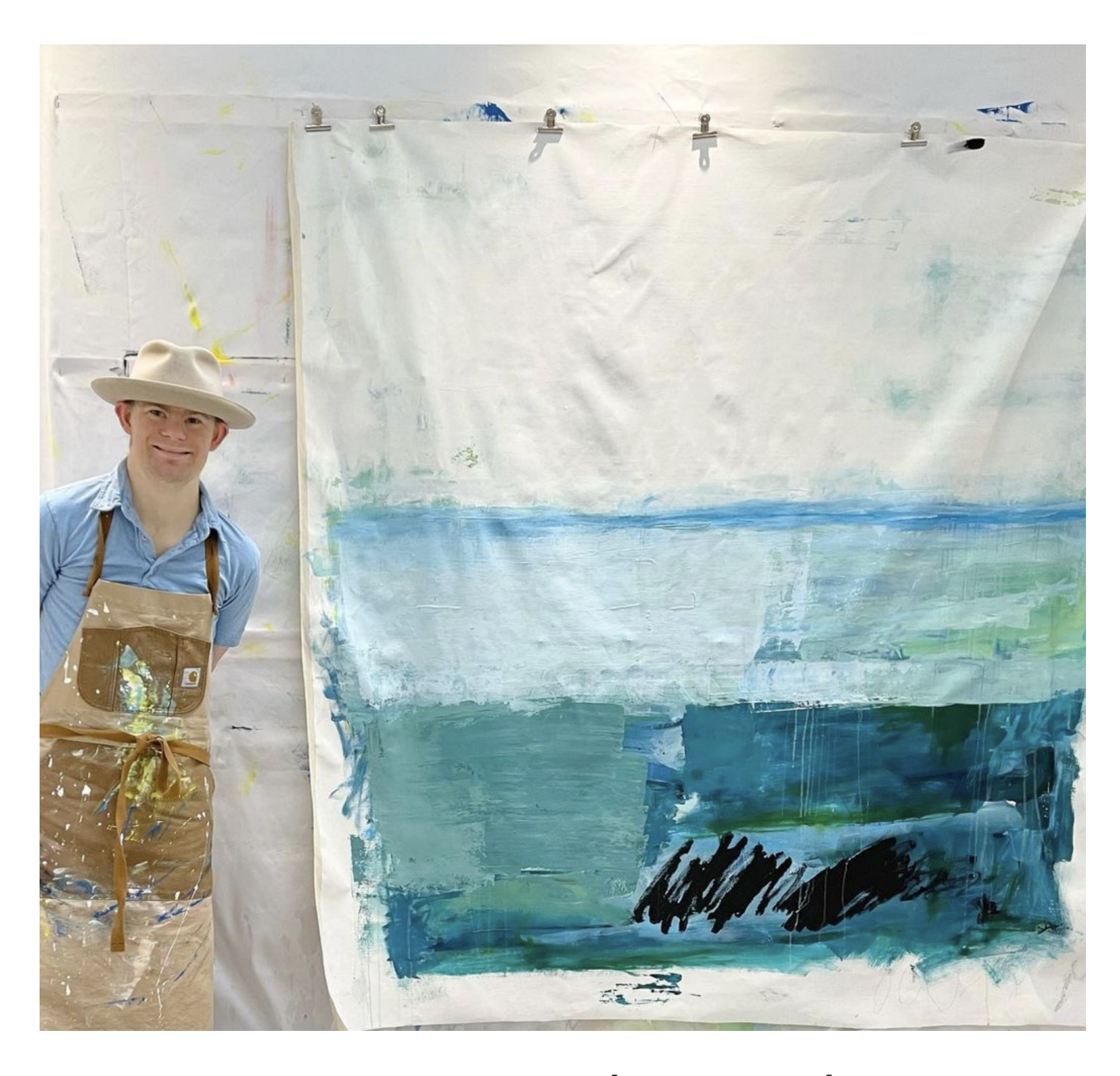
In the Fathoms Below