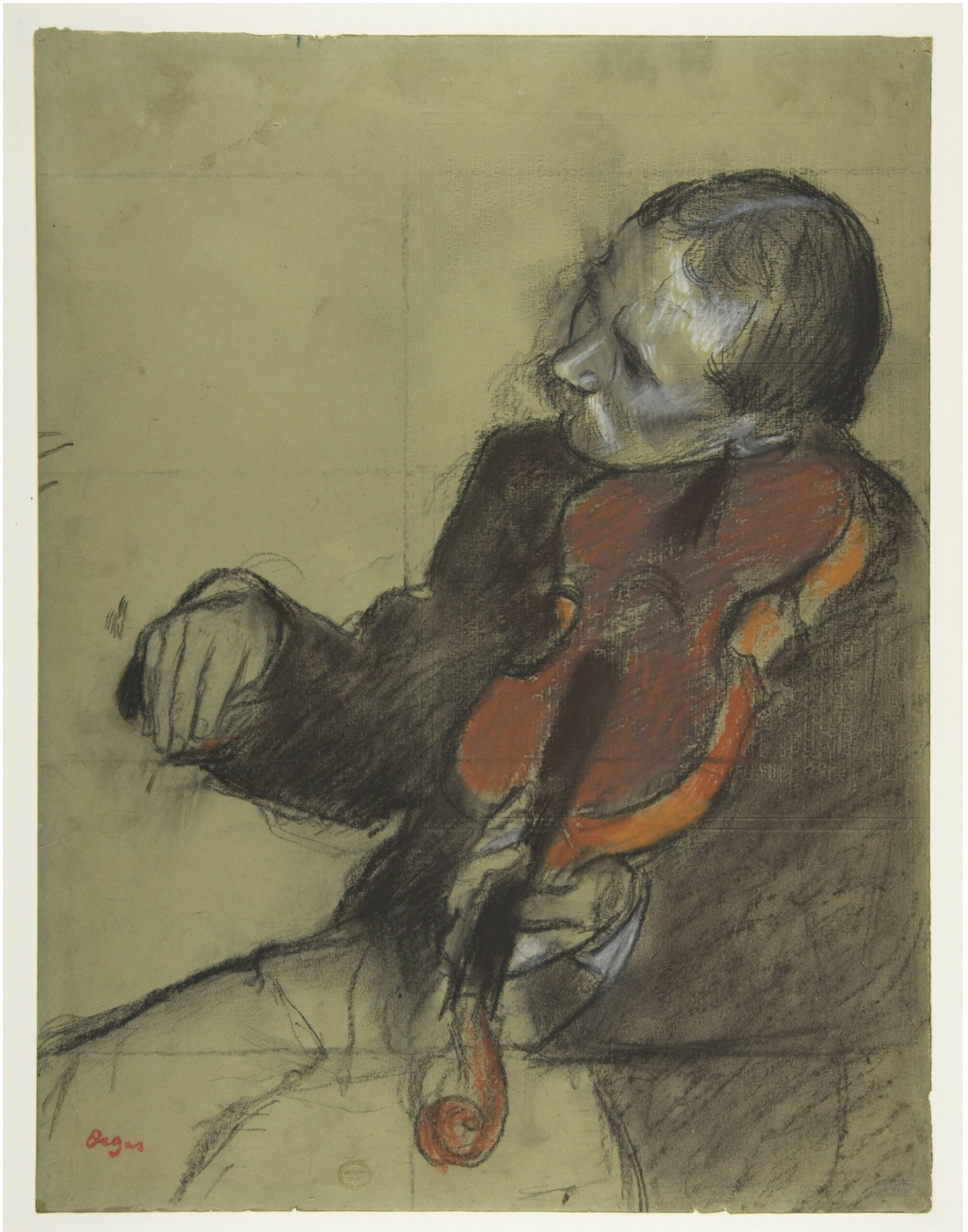
Violinist, Study for "The Dance Lesson" ca. 1878-79