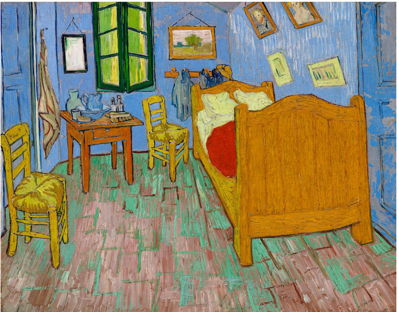
Top: Detail: The Bedroom (1889) by Vincent Van Gogh.