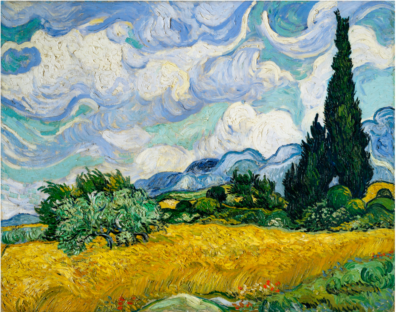
Top: Detail: Wheat Field with Cypresses (1889) by Vincent Van Gogh. Original from the MET Museum.