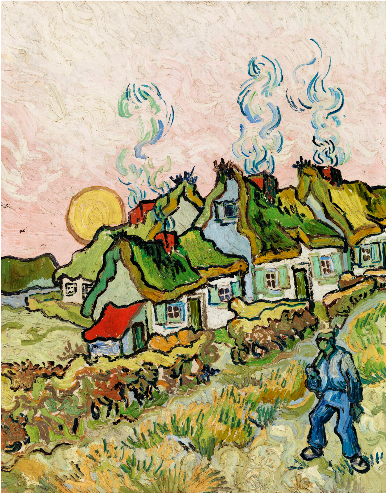
Top: Detail: Houses and Figure (1890) by Vincent Van Gogh.