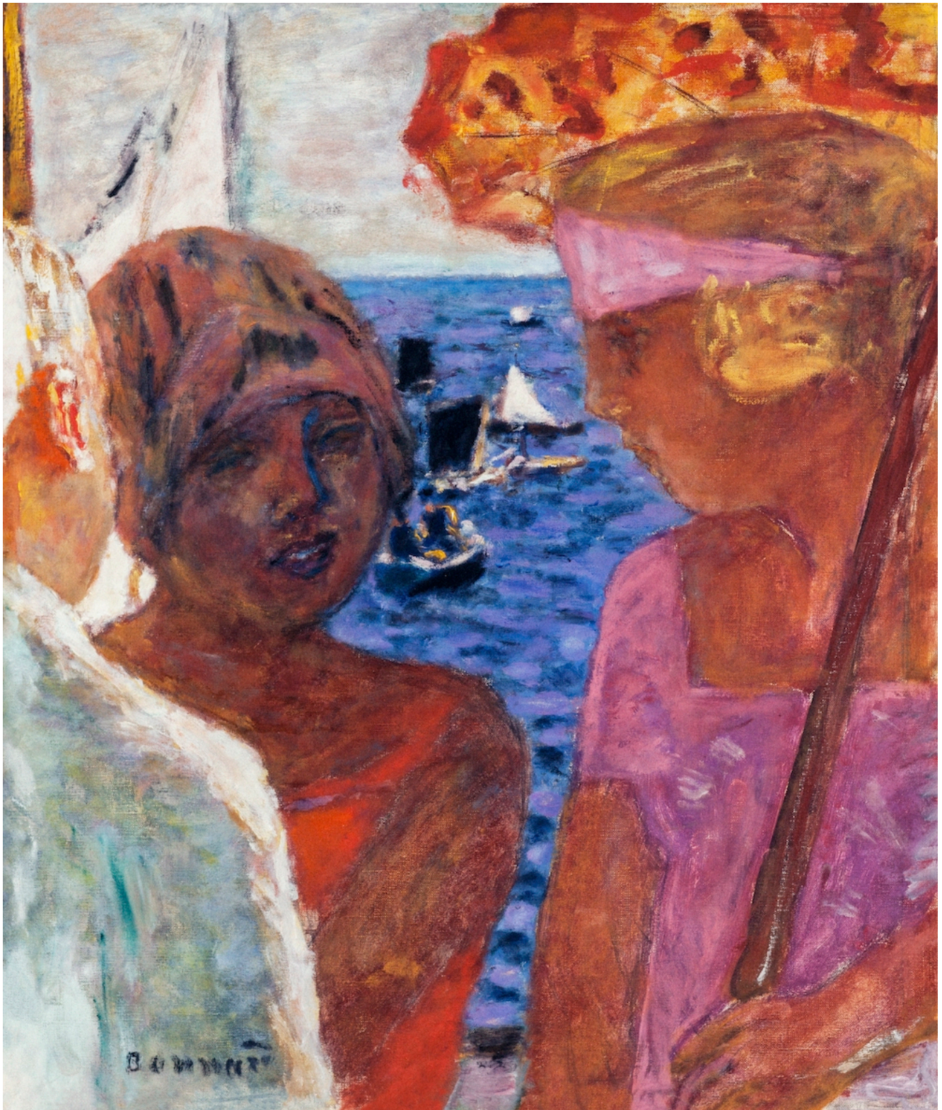
Conversation in Arcachon (1926-1930) painting by Pierre Bonnard. Original from the Public Institution Paris