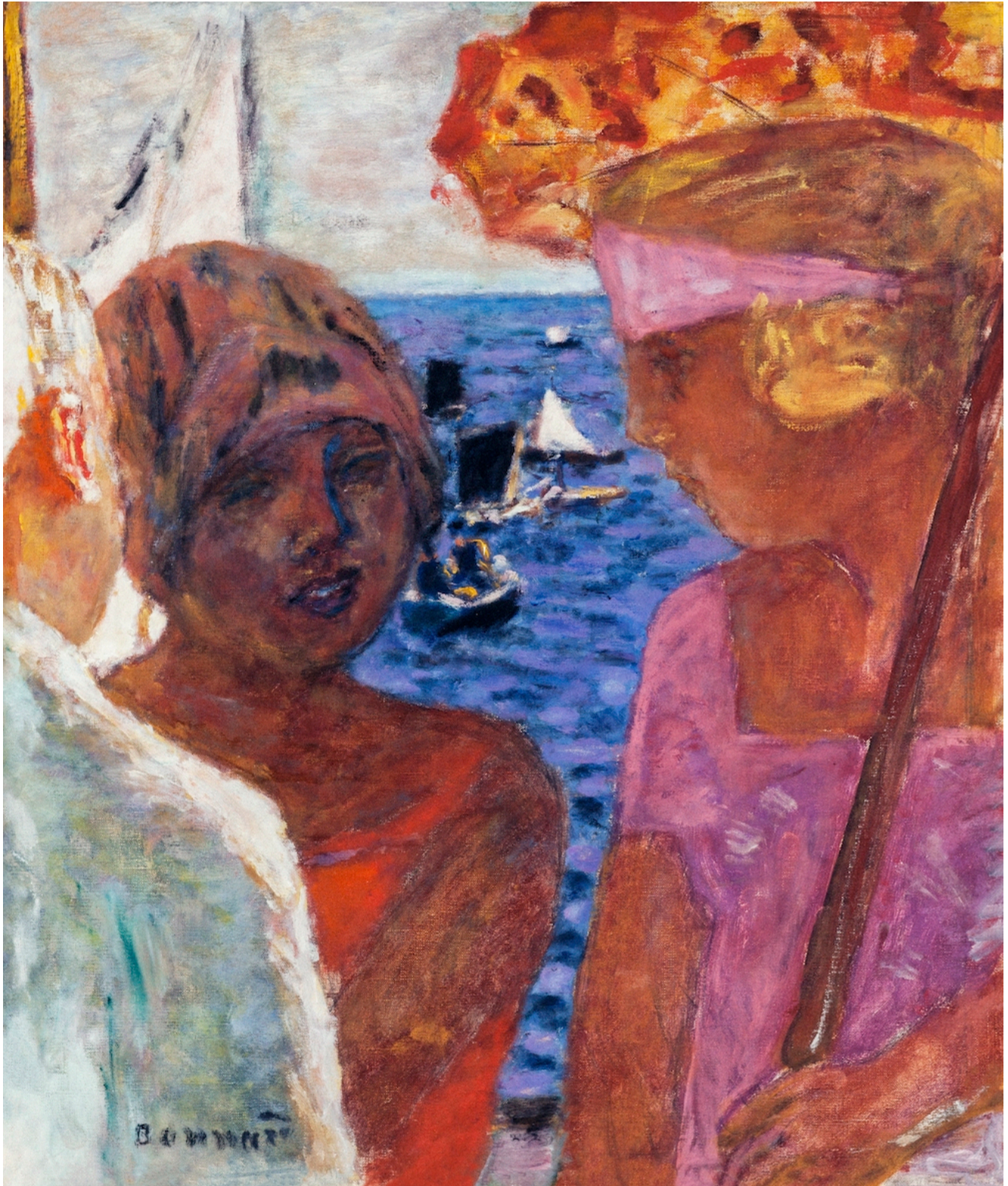
Conversation in Arcachon (1926-1930) painting by Pierre Bonnard. Original from the Public Institution Paris