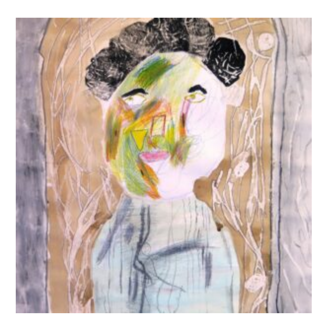
DRAWING FROM LIFE & MAKING CARTOON CHARACTERS

Visual Arts Planning Collections: Portraits