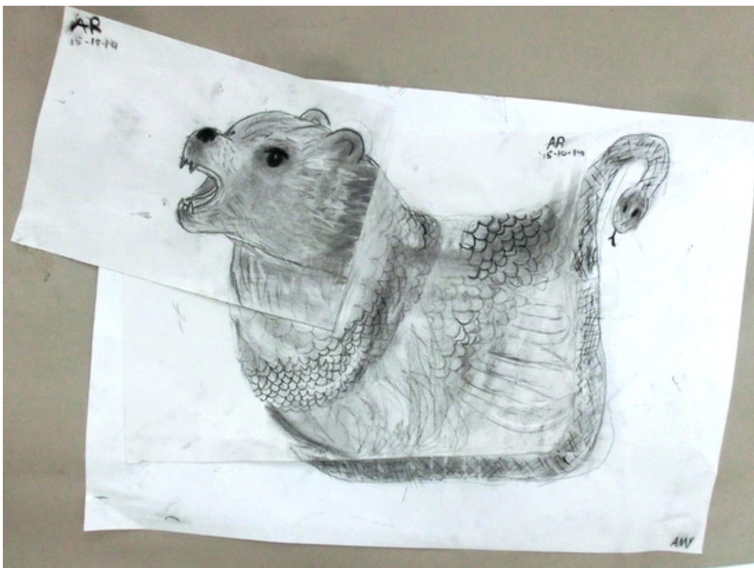
Amy's 'Bear - hen - snake' with Ellie Somerset in The Little Art Studio

Following drawings sessions looking at plastic toy animals and doing Backwards Forwards Sketching drawings as well as drawing fur, scales and feathers, I decided that the children might like to play god and invent their own beasts.