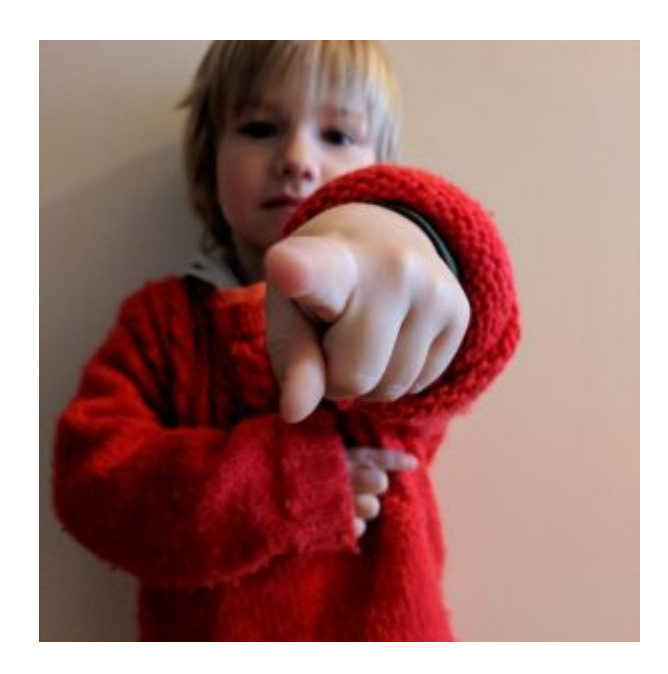
Explore Resources.... Shape

<u>Hester explains how seeing shapes</u> <u>objectively can help our drawing skills.</u>