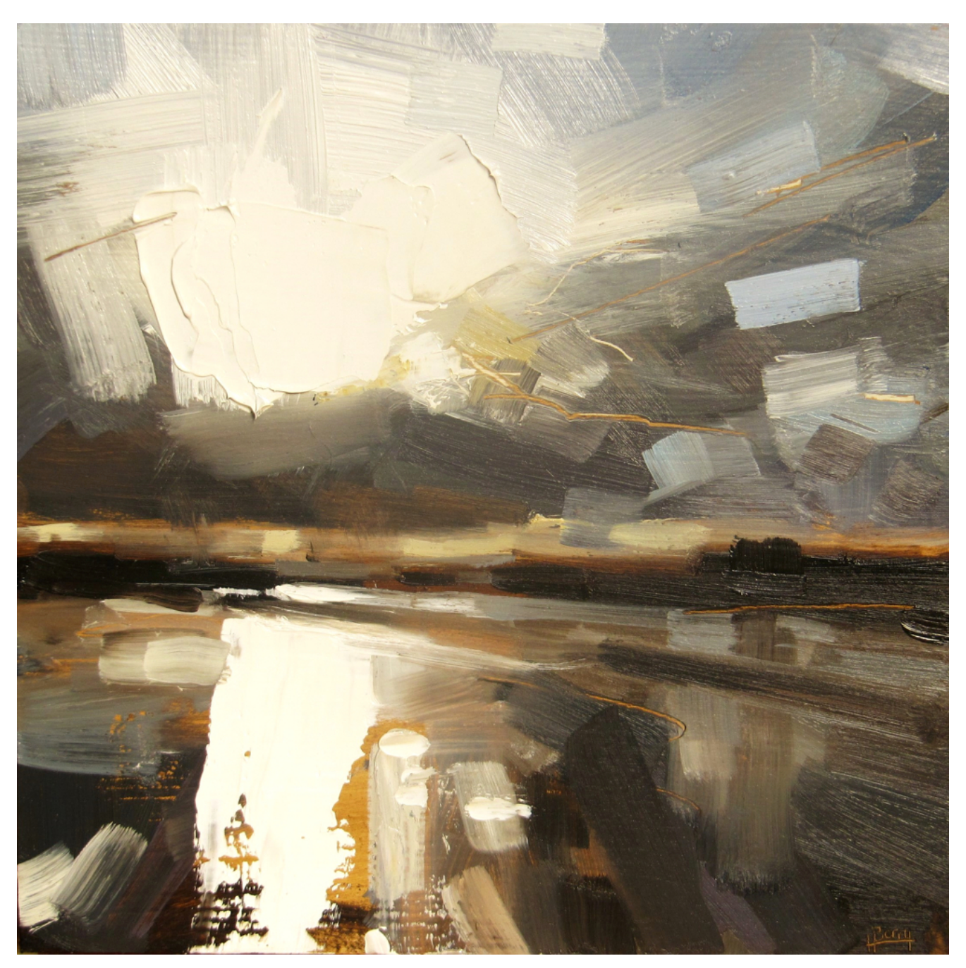
'Instow' by Hester Berry, oil on board, applied with a palette-knife, brush, cloth, removed with cloth, scratched with a palette-knife.