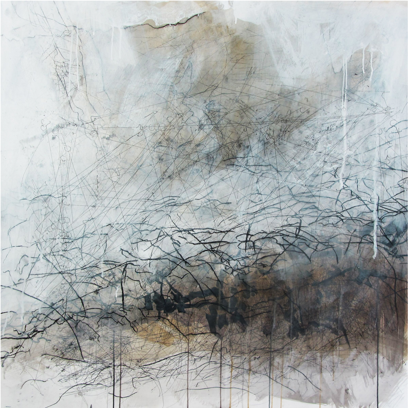
Sheep-cam in barn 00.45 – 02.25 Debbie Locke & Sara Dudman