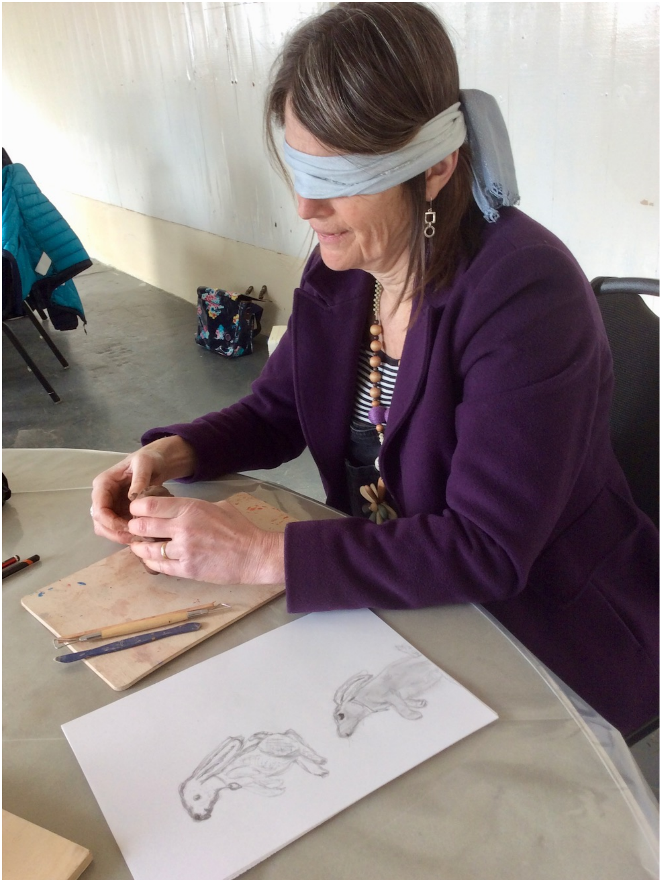
After drawing a rabbit through sight and touch a teacher goes on to create it through memory, using only touch