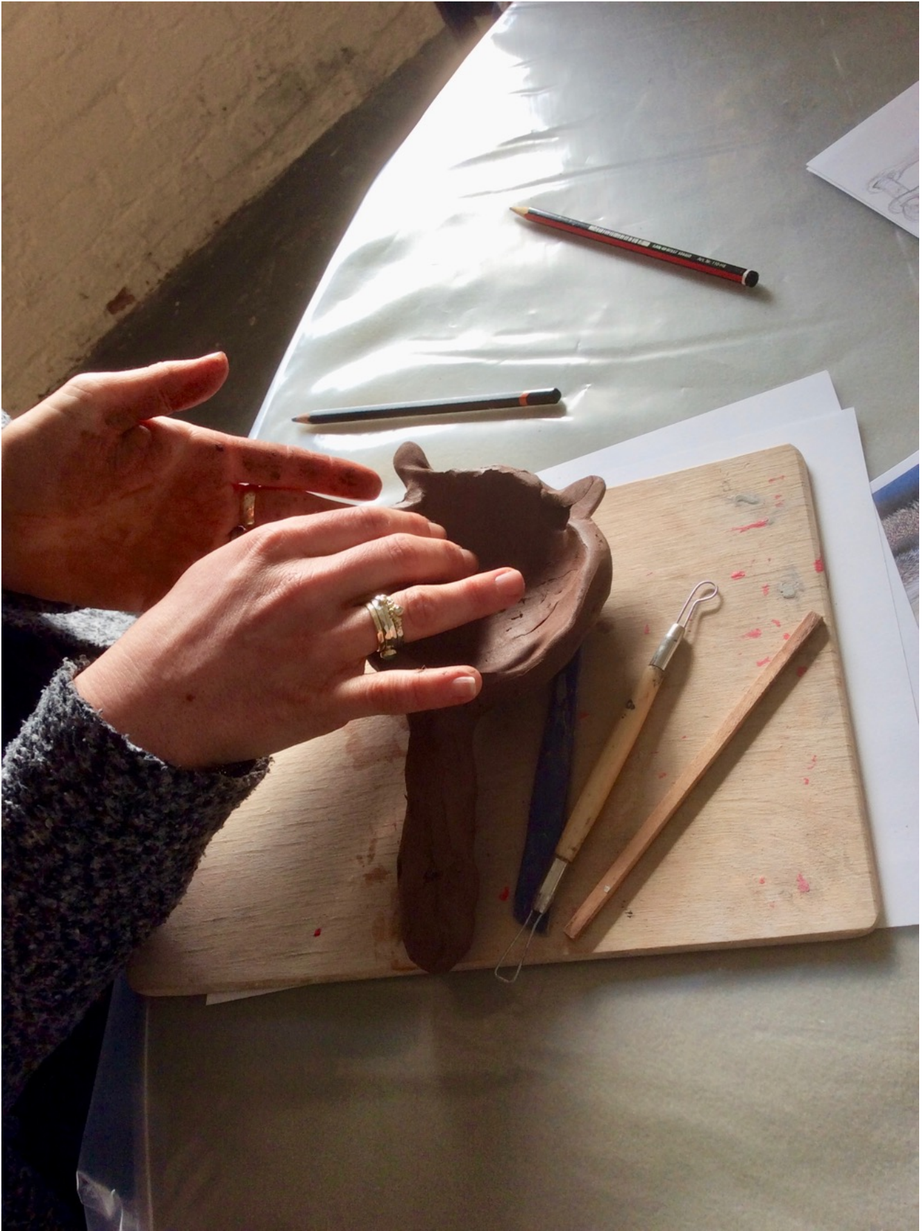
The tea strainer challenges the individual when considering convex and concave structures