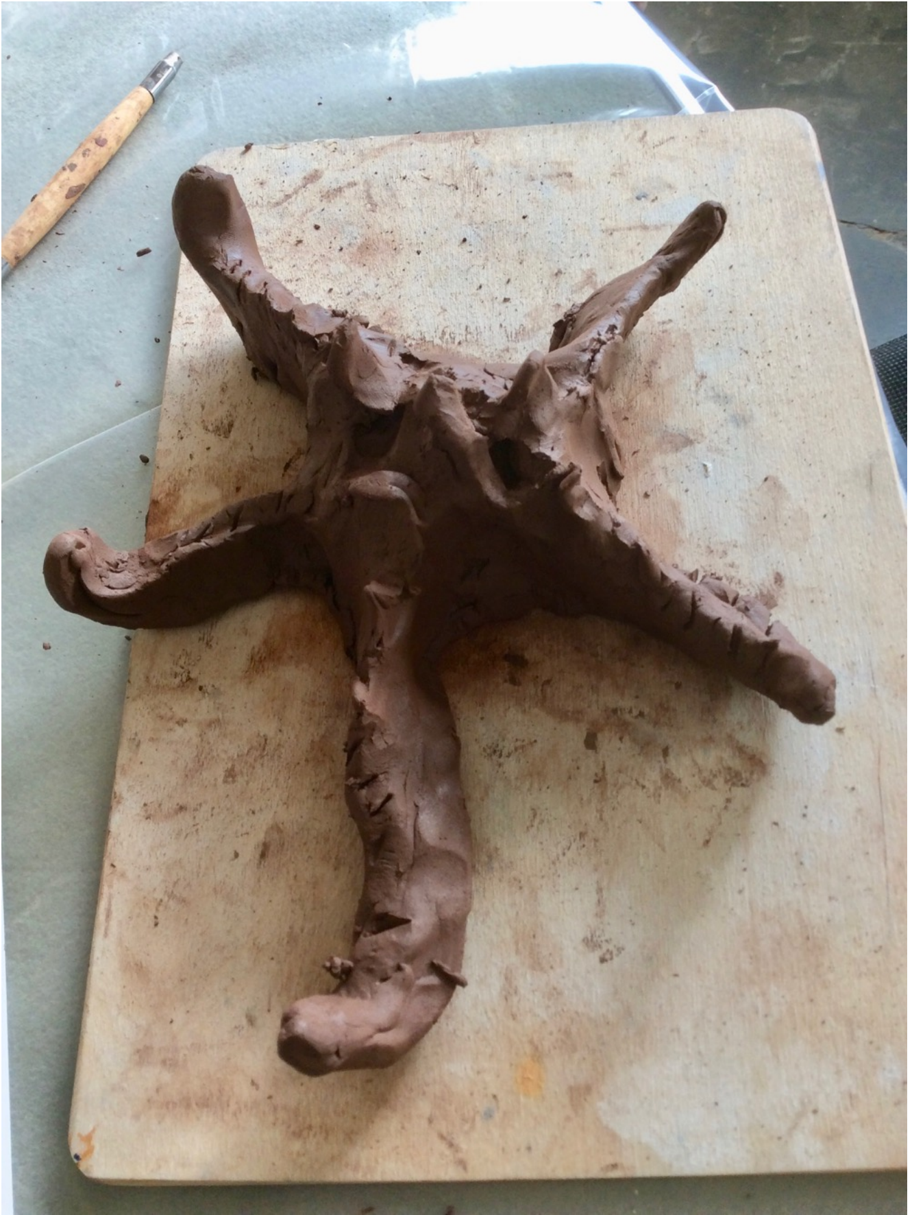
Finished star fish made in clay blind-folded