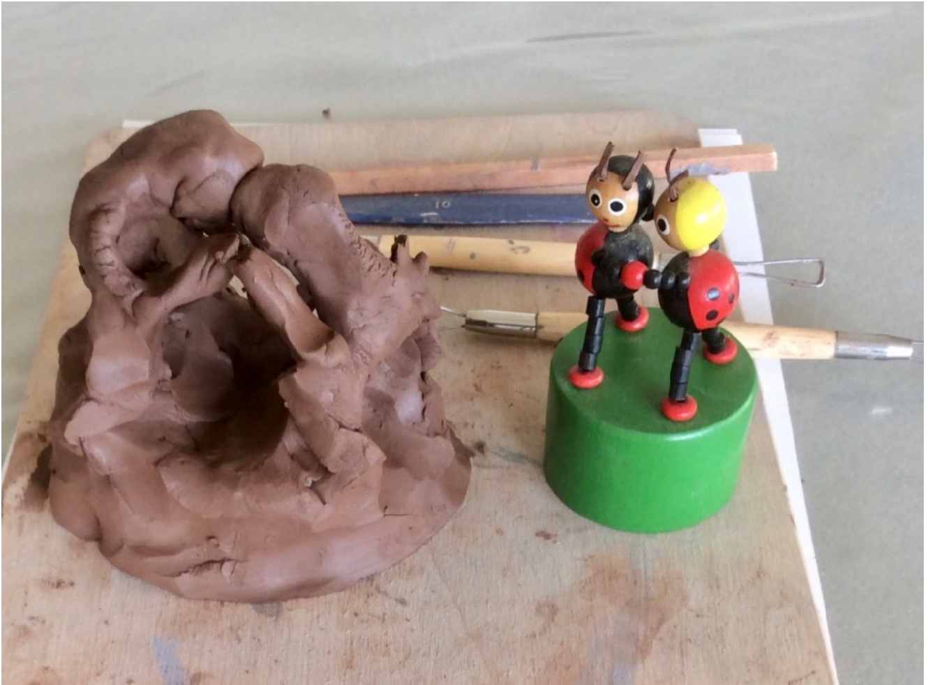
A collapsible toy: challenging and difficult, yet very familiar