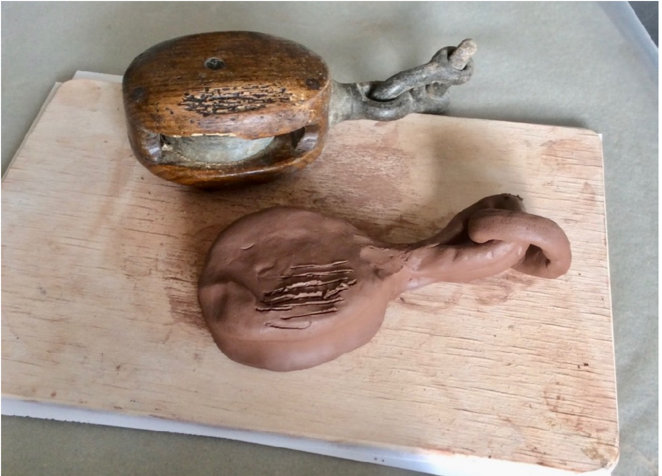
The pulley and chain, a fascinating object