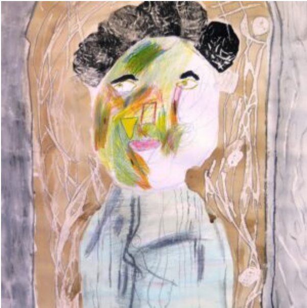
Egg Box Gargoyles