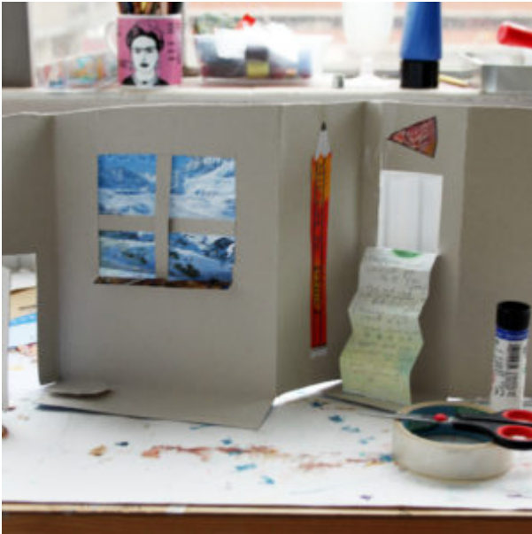
World in a matchbox