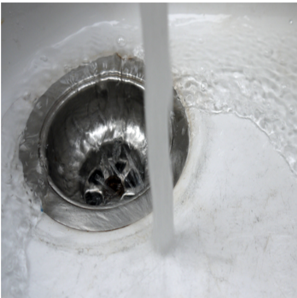
Drawing Pouring Water