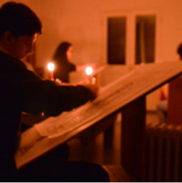
Candlelit Still Life