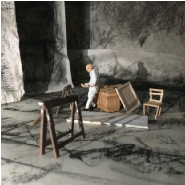
Expressive Charcoal Collage: Coal Mines