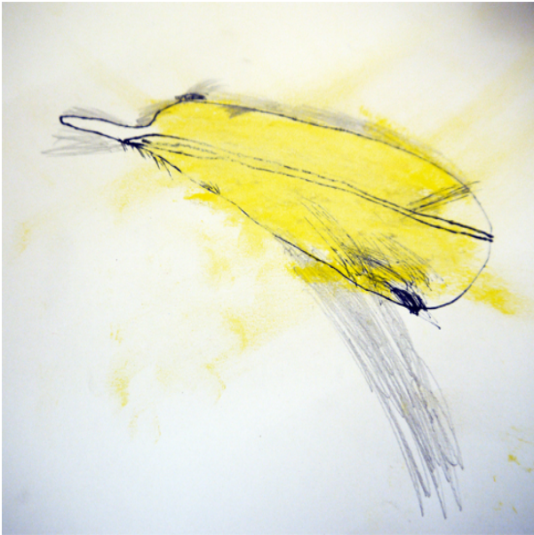
Drawing Feathers: Perfect for Mark Making