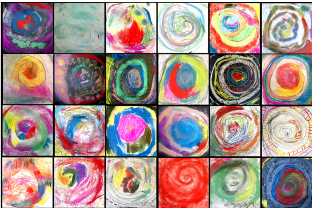
Drawing Spiral Snails by Tracy McGuinness-Kelly

Each child then created a spiral on a large square of white cartridge paper or black sugar paper, using chalk and oil pastels.