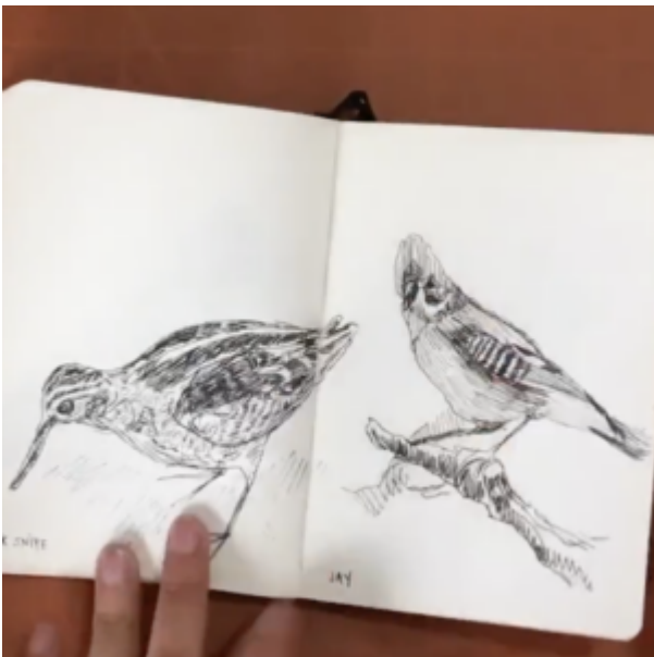
Sketchbooks in the community