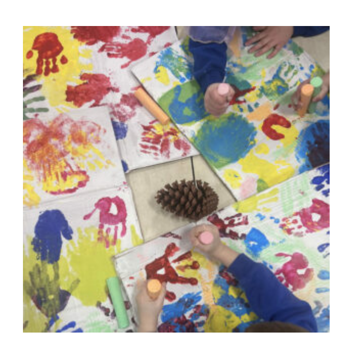
If You Use AccessArt Resources... You might like to...