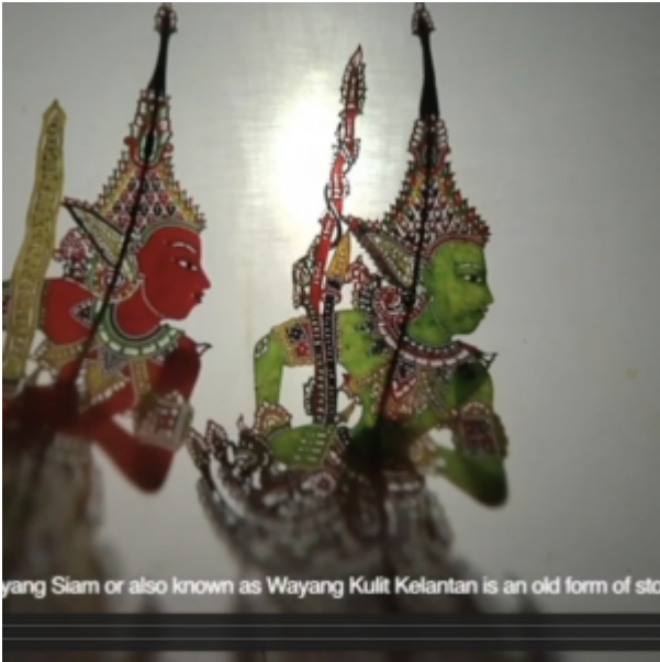
Wayang Siam or also known as Wayang Kulit Kelantan is an old form of story