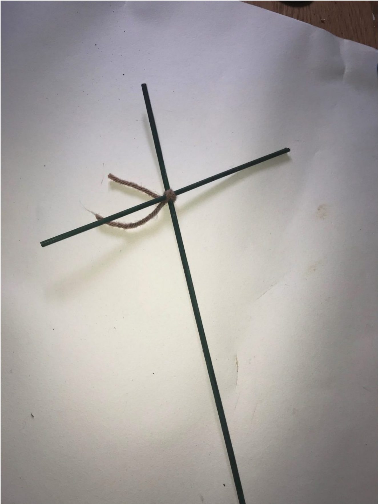
Two rods were cut, approximately 30cm and 10cm and joined in a cross position using wool.