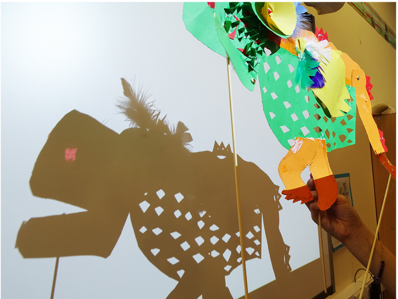
Shadow Puppets at Bourn Primary Academy

As part of Bourn Primary Academy Art Week 2016, I visited the Year Six class to spend the day making shadow puppets, using the whiteboard projector as a way to cast shadows.