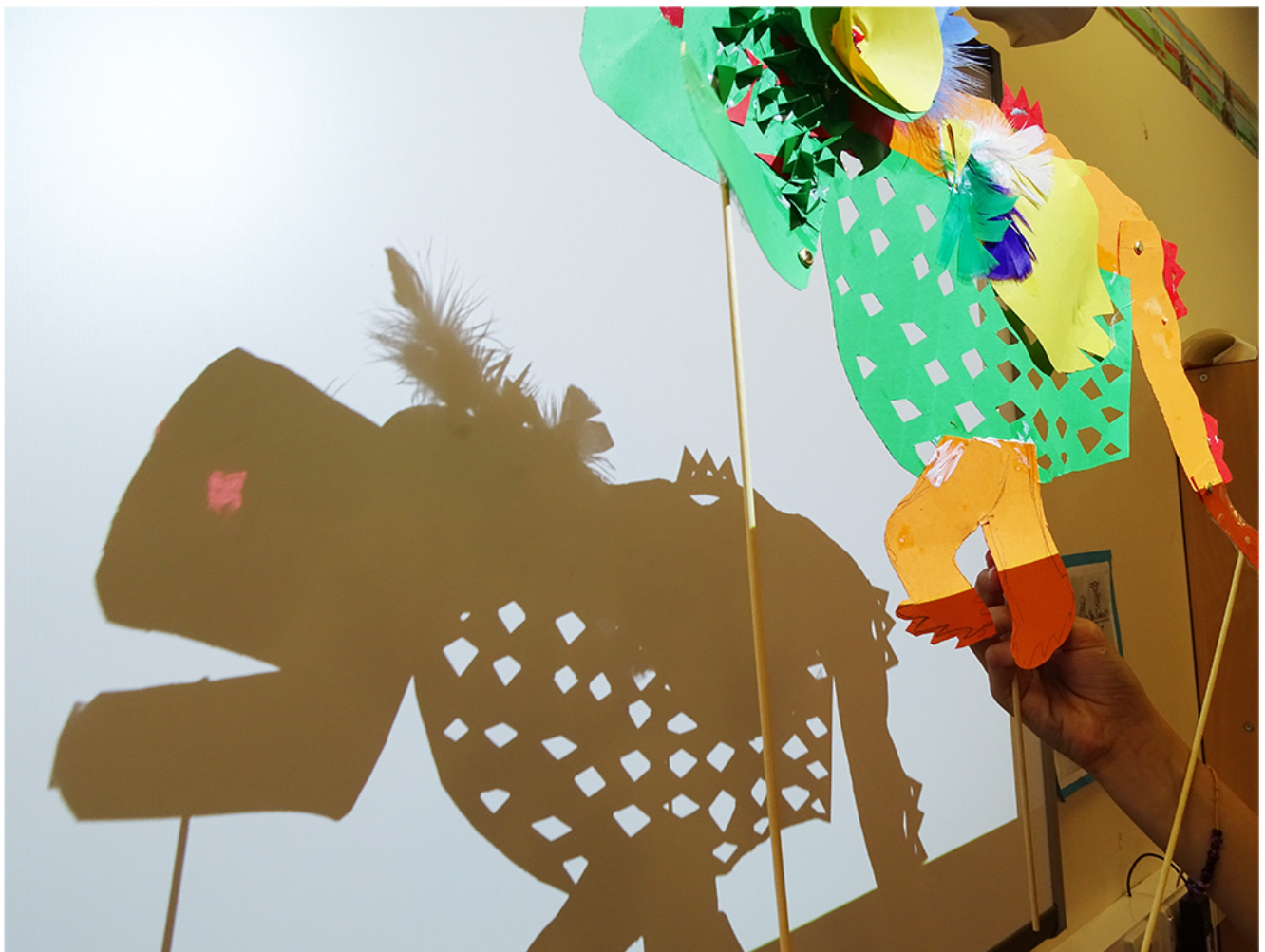
Shadow Puppets at Bourn Primary Academy

As part of Bourn Primary Academy Art Week 2016 , I visited the Year Six class to spend the day making shadow puppets, using the whiteboard projector as a way to cast shadows.