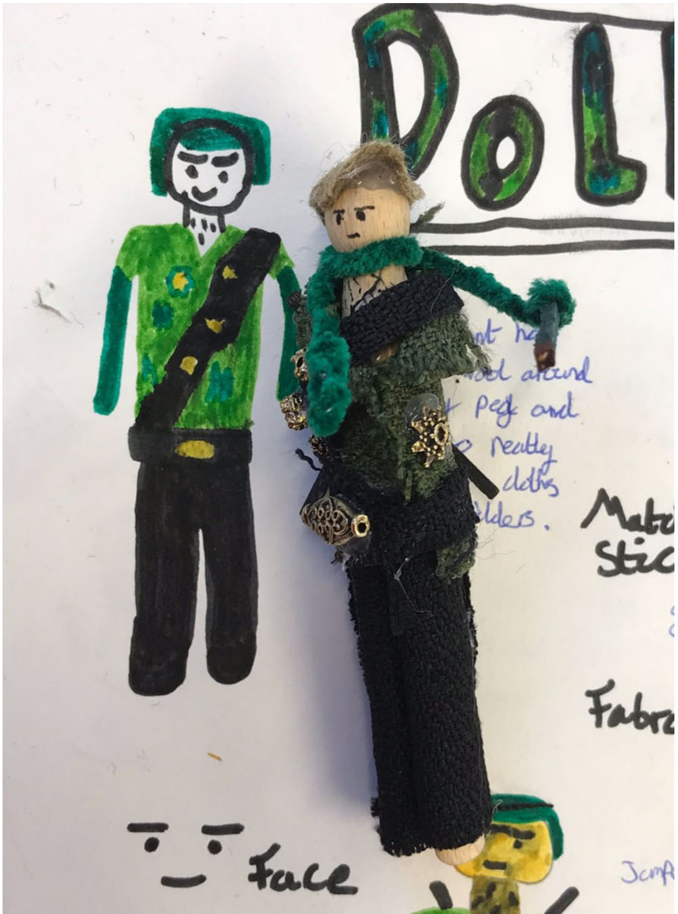
Our older children spent time adding finer details to their soldier. Wool was carefully wrapped around the peg to create the uniform and fixed into place with either PVA glue or a